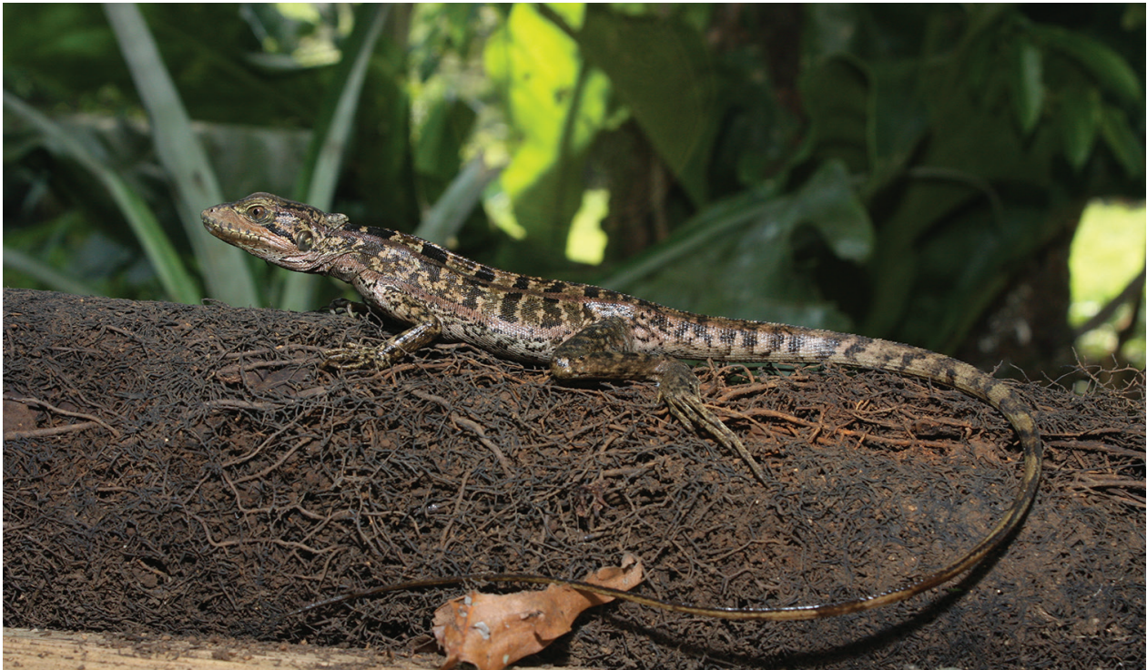
Figure 1. Gravid female of Basiliscus vittatus from La Selva del Marinero, Catemaco, Veracruz.

clutch mass, TW). Female lizards were then transported to the laboratory within large cotton bags.