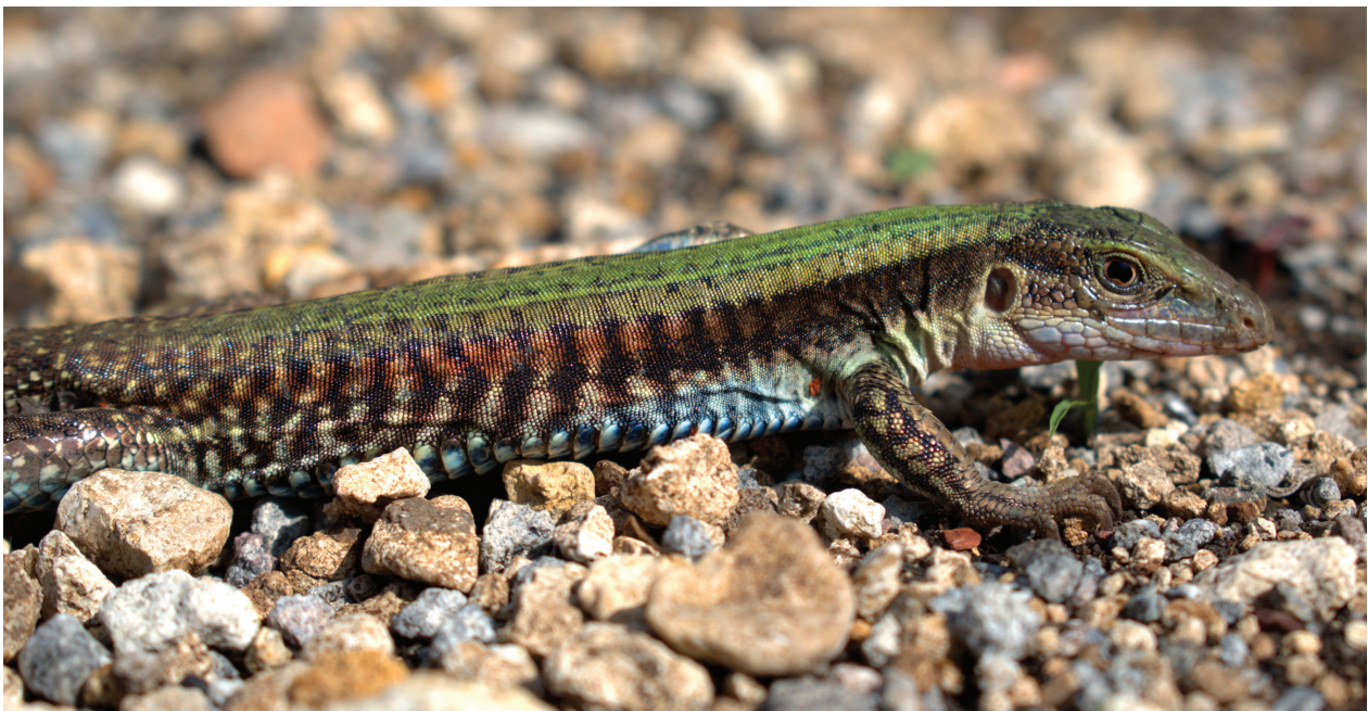
Figure 1. Adult female of Balsas Basin Whiptail, Aspidoscelis costatus costatus , from Ixtapan de la Sal, Estado de México, México.

Females of A. costatus costatus were captured by hand along a drift fence during their activity period (09:00–17:00 h) in June 2006, and from May to July 2007. The reproductive condition of each adult female was evaluated based on an abdominal palpation and a visual assessment, where the vitellogenic/gravid females showed an expanded contour in the abdomen region (Suárez-Varón et al. 2019). Snout-vent length (SVL) and mass were recorded to the nearest 1 mm and 0.1 g, respectively. Only vitellogenic and gravid females were euthanized via an intraperitoneal injection of sodium pentobarbital, and ovaries and oviducts were removed and placed in 10% neutral buffered formalin. Clutch size was estimated by counting vitellogenic follicles ( \geq 3 mm, precision 0.01 mm, López-Moreno et al. 2016) or shelled oviductal eggs when present. We also calculated the relative clutch mass (RCM, based