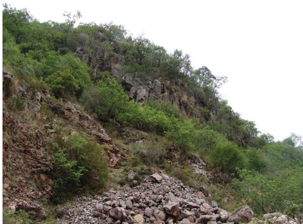
Figure 3. Habitat of Balsas Basin Whiptail, Aspidoscelis costatus costatus , at Ixtapan de la Sal, Estado de México, México.

only on oviductal eggs) by dividing clutch mass (precision 0.0001 g) by female's total mass (including clutch weight; Tinkle 1972). All measurements were carried out following appropriate guidelines for Scientific Animal Use, unnecessary stress was avoided, and individuals were humanely sacrificed. Females were deposited in the Laboratorio de Herpetología, Facultad de Ciencias, Universidad Autónoma del Estado de México, México (voucher numbers pending). All lizards were collected under the Scientific Collector Permit, FAUT 0186 SEMARNAT (Secretaría de Medio Ambiente y Recursos Naturales).