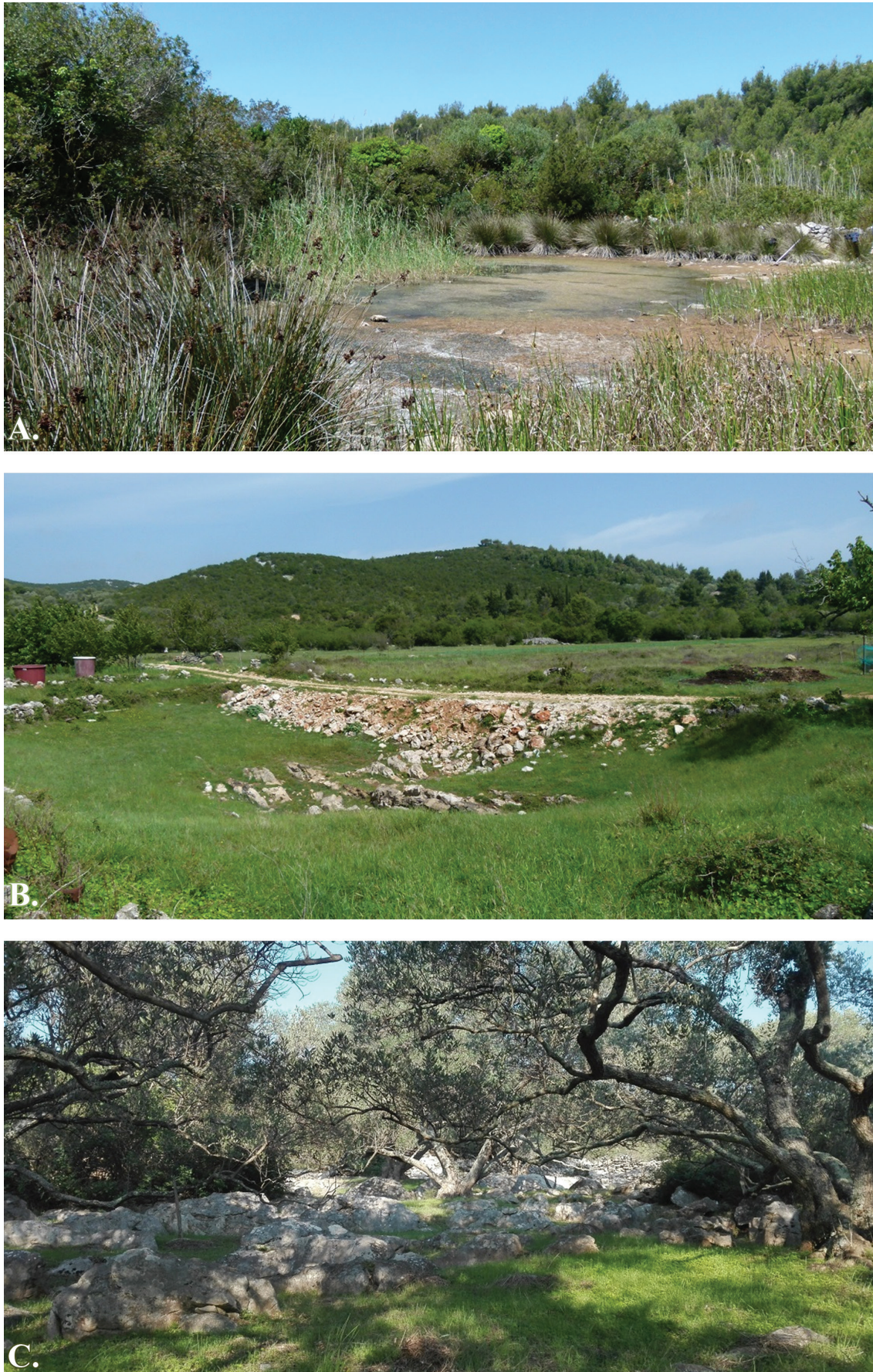
Figure 1. A. A pond situated near Lojišće Bay on Dugi Otok, a typical aquatic habitat on the Adriatic Islands. (Photo by Ana Štih); B. Grassland habitats in the south of Dugi Otok (Photo by Ana Štih); C. Olive groves in the northern part of the Island, a suitable habitat for many reptile species. (Photo by Daria Kranželić).