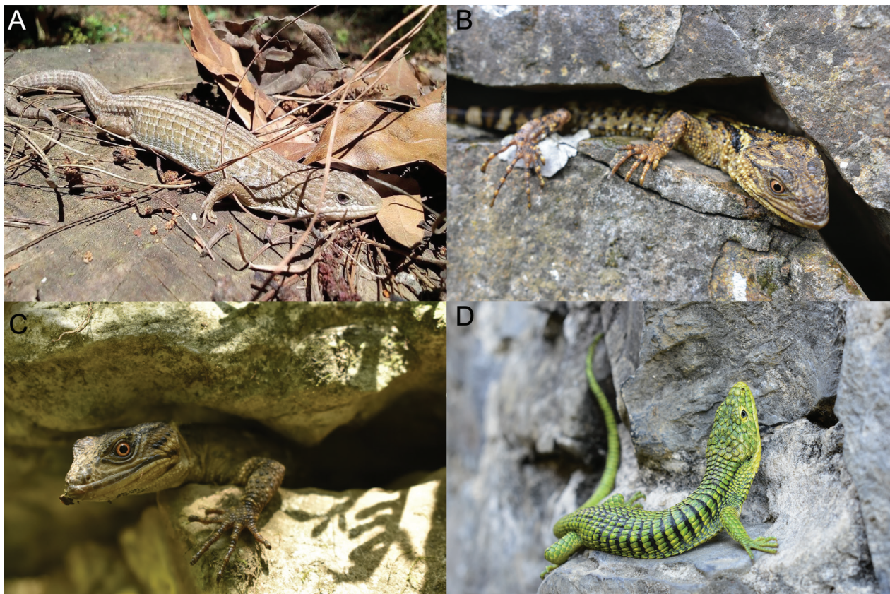
Figure 1. Photographs of A) Barisia imbricata , B) Xenosaurus fractus from Tlatlauquitepec, C) Xenosaurus fractus from Xochititan, and D) Abronia graminea .