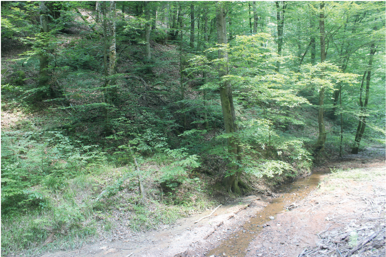
Figure 3. Habitat of Darevskia praticola from Săvârșin N-E, Romania.

as Vipera ammodytes (Linnaeus, 1758) reached their northern range limit in this area, but their distribution in the area seems limited by climatic factors (Ghira 2016). Nevertheless, the suitability of the region populated by D. praticola (Ćorović et al. 2018) advocates against this point of view, supporting its status as a recent immigrant to the region. Moreover, V. ammodytes is distributed some tens of km north (Cogălniceanu et al. 2013; Ghira 2016). Thus, nowadays D. praticola occupies only a small bridgehead north of the Mureș River, from where it slowly spreads to the west, east, and north, following the forests' boundaries. This assumption is supported also by earlier studies on the region's herpetofauna (e.g., Ghira et al. 2002; Covaciu-Marcov et al. 2005), which did not mention D. praticola north of the Mureș River. Thus, it is possible that the species recently occupied this bridgehead north of the river. This also disproves the hypothesis that the isolated populations from Poiana Ruscă Mountains are relicts of a former larger distribution in the warmer period of the postglacial (Bogdan et al. 2011). This apparent isolation rather may be the result of insufficient studies.