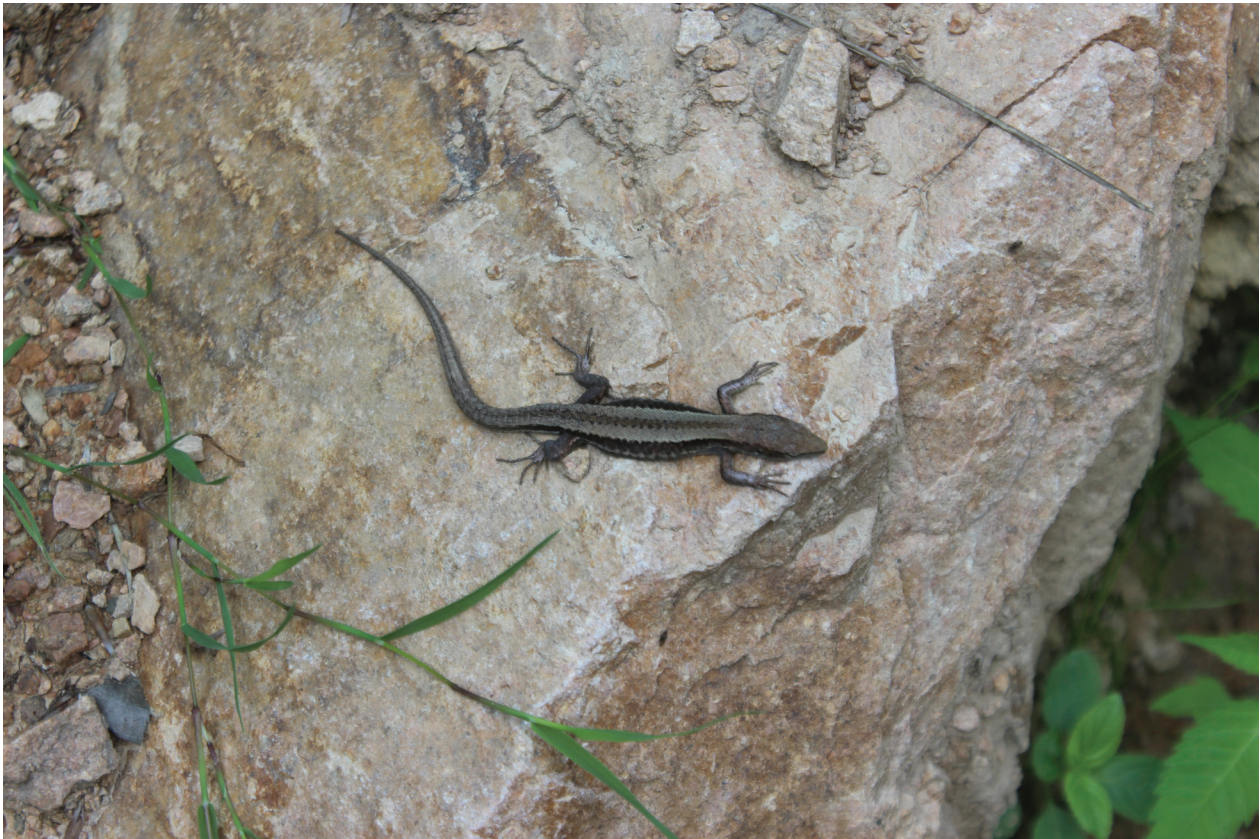
Figure 1. Representative picture of Darevskia praticola from Săvârșin N-E, Romania.

of the river from the previously known localities (Gaceu and Josan 2013). Totally we investigated 16 localities on both sides of the Mureș River. The lizards were directly observed, and the individuals were not disturbed. We walked transects of different lengths through habitats considered characteristic for this species, namely broad-leaved forests with wet areas (e.g., Fuhn and Vancea 1961; Covaciu-Marcov et al. 2009; Gherghel et al. 2011; Gaceu and Josan 2013) as well as through less typical habitats. We spent approximately half an hour in each location, depending on the habitats. Observations were documented with photographs of individuals (when possible) and surrounding habitats. We recorded coordinates and altitudes for all observations.