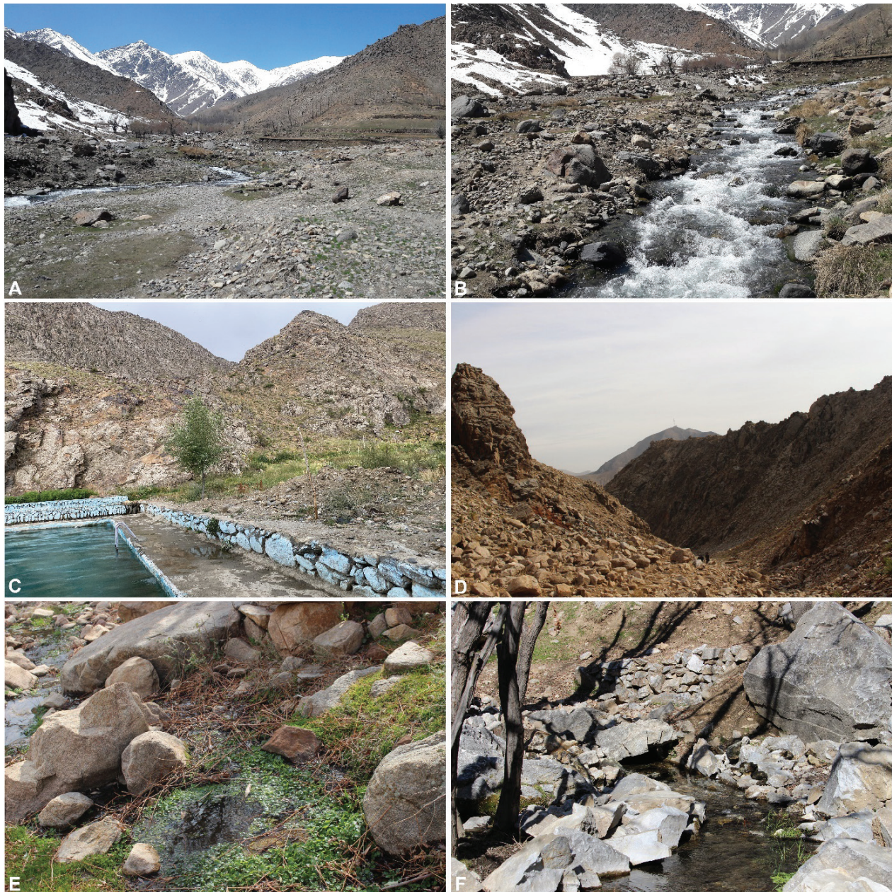
Figure 2. Localities and habitats in Afghanistan where Paradactylodon ( Afghanodon ) mustersi were observed. A, B. Paghman area, Kabul Province (three individuals at April 8, 2017); C. Paghman area, Kabul Province, a human-made pool (one individuals, July 15, 2021); D, E. Shutul Valley, Panjshir Province (five individuals, November 9, 2018); F. Gardana Qalatak area, Salang, Parwan Province (three individuals, May 3, 2019).

Two field surveys in Gardana Qalatak (35.2317°N, 69.2086°E, 2,009 m; Fig. 1, loc. 9; Fig. 2F) of the Salang Valley in Parwan Province resulted in observations of three individuals (Fig. 3E). These were found under rocks in shallow water, where the stream flow was relatively low, as well as near springs that produced cooler water (10.8 °C) than that of the stream. One individual was found during the 2018 December investigation in running water and was fully active. Vegetation that covered streams included N. officinale , Schoenoplectus lacustris , and Cynodon dactylon . This locality confirmed the historical records of the species in the Salang area.