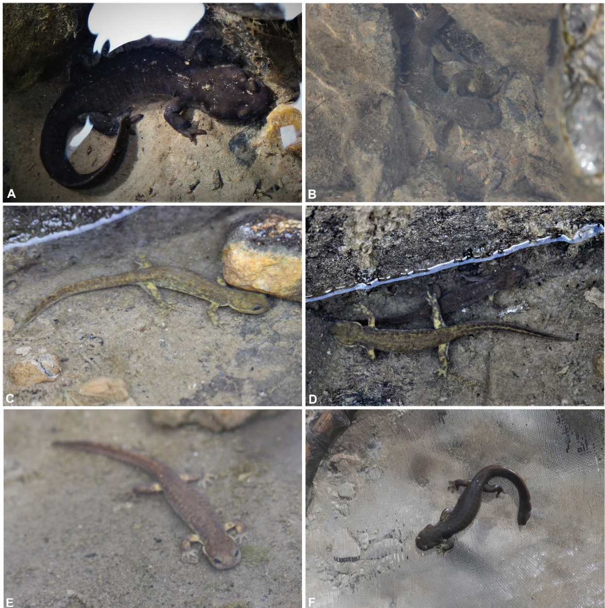
Figure 3. Observed individuals of Paradactylodon (Afghanodon) mustersi from: A, B. Paghman stream, Kabul Province, May 11, 2018 and April 8, 2017, respectively; C, D. Shutul Valley, Panjsher Province, November 9, 2018; E. Salang Valley, Parwan Province, May 5, 2019; F. Qal'ah-ye Salim Khan, Farza District, Kabul Province, July 24, 2021 (PMNH 2263).

our visits. All individuals were adults (sex was not determined) and each of them had 14 coastal grooves extended to their tails. Their total length ranged from 92.0 to 160.0 mm, a tail length between 45.2–75.6 mm, head length 14.8–20.0 mm, and abdomen width 12.7–18.3 mm. The coloration of the body was dark brown to yellowish olive, in some individuals indistinctly speckled with tiny dots (Fig. 3C, D). The tail is oval at the base but flattening at the end.