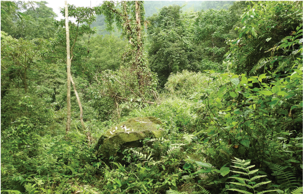
Figure 4. Habitat of Takydromus sikkimensis in Nepal.

(Subedi et al. 2021). Geographically, the Chure hill range covers 12.8% of Nepal's area. However, the biodiversity of the area is poorly documented (Chetry et al. 2021). Fewer studies have been conducted in recent years in Chure hills but they have occasionally resulted in a new herpetofauna species record such as Varanus salvator (Laurenti, 1768) and Hydrophyllax leptoglossa (Cope, 1868) from Nepal's eastern Chure (Bhattarai et al. 2020). In addition to T. sikkimensis , we also recorded other associated reptile species such as snakes; Coelognathus radiatus (Boie, 1827), Dendrelaphis tristis (Daudin, 1803), Lycodon aulicus (Linnaeus, 1758), Oligodon albocinctus (Cantor, 1839), Psammodynastes pulverulentus (Boie, 1827), Rhabdophis helleri (Schmidt, 1925), and lizards such as Calotes versicolor (Daudin, 1802), Cyrtodactylus sp. Hemidactylus sp. Eutropis carinata (Schneider, 1801), E. macularia (Blyth, 1853), Varanus bengalensis (Daudin, 1802).