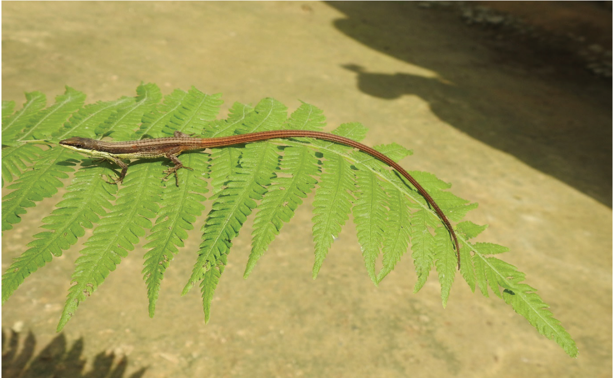
Figure 1. Full body photo of Takydromus sikkimensis from Miklajung, Morang Nepal.

On 8 September 2021, at 15:35 h; the first author observed a specimen during diurnal herpetological surveys in Chure hills of Miklajung, Morang district, Province-01, Nepal. On close observation, it appeared different from other local lizard species known from the area by having a long tail and greenish belly part. This animal escaped when approached. Another individual was sighted ca. 03 km east of the earlier location on the 9 September 2021. The specimen was found in tropical mixed Schima-Castanopsis forest habitat in the upper Chure hills (Chettry et al. 2021) at 720 m msl. The lower grassy vegetation of the locality is characterized by Microlepia speluncae , Brachiaria ramosa , Cyathea spinosa , Pteris biaurita , Cynodon dactylon (Ojha and Niroula 2021). The specimen was captured by hand, photographed, and measured with vernier callipers; scales were also counted. After collecting morphometric and meristic data, the specimen was released at the point of capture (Fig. 2).