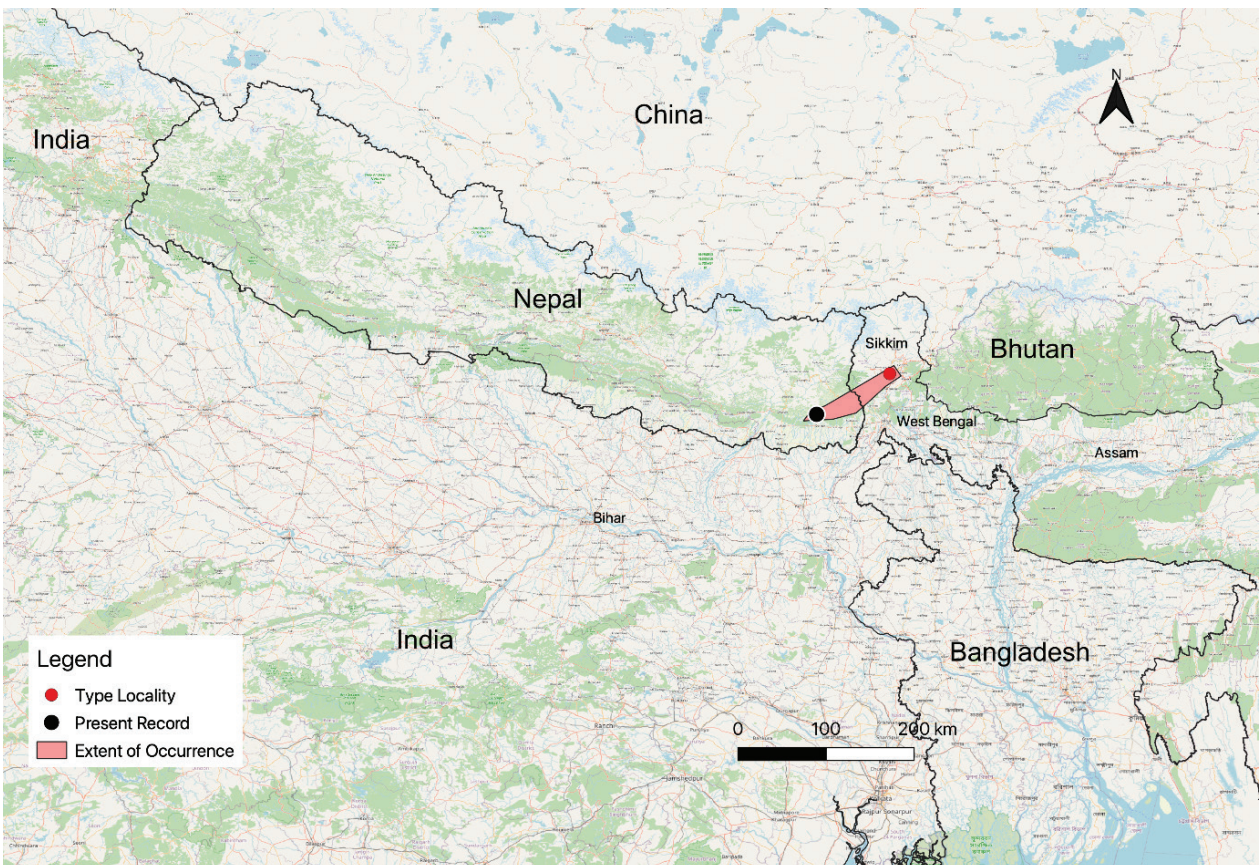
Figure 3. Map showing distribution of Takydromus sikkimensis .

The Chure or Siwalik hills are one of the youngest mountains of the Himalayan chain, extending from Indus River in Pakistan in the west through India and Nepal in the west and centre and to the Brahmaputra River in the