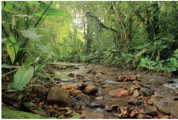
Figure 1. Quebrada La Carrizalosa, near the basin of the Wuarska river, the locality where Polychrus guttuerosus was found.