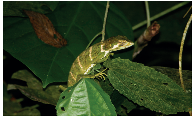
Figure 2. Polychrus guttuerosus in-situ, found inactive during the night of 30 January 2022 at 20:52.

The specimen has the following measurements (mm): snout-vent length: 118.10; tail length: 353.00; total length: 471.10; head length: 26.90; head width: 20.50; head height: 16.90; hand length: 62.91; foot length: 78.06; axilla-groin length: 71.26; eye diameter: 4.44; weight: 35 g. Most of the morphometric data obtained from our male specimen (CBZ-H-002) detailed in Table 1 agreed with the measurements, counts, and proportions for male specimens reported by McCranie (2018) and Koch et al. (2011), except for the comparisons mentioned in our discussion.