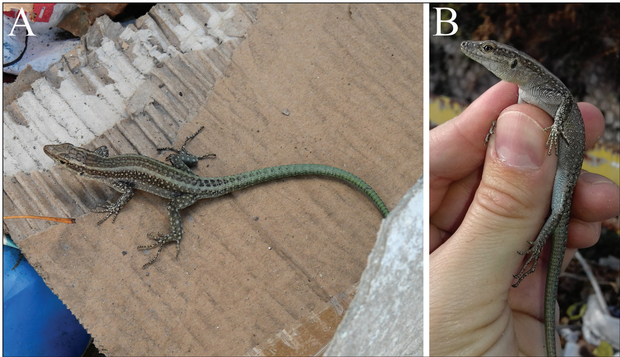
Figure 2. The captured individual, in situ photography (A) and in hand (B).

first 25% trees were discarded as burn-in, as a measure to sample from the stationary distribution and avoid the possibility of including random, sub-optimal trees. A majority rule consensus tree was then produced from the posterior distribution of trees, and the posterior probabilities were calculated as the percentage of samples recovering any particular clade. Posterior probabilities \geq 0.95 indicate statistically significant support (Huelsenbeck and Ronquist 2001).