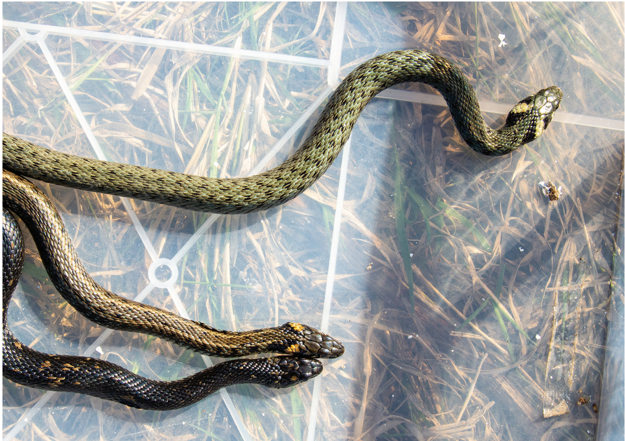
Figure 2. Polymorphism observed in Natrix natrix populations from DDBR. Top common morph; middle double yellow stripes pattern; bottom melanotic morph.