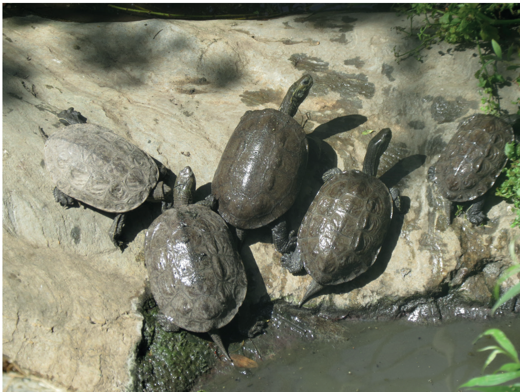
Figure 5. Mauremys rivulata in sewage water of the Chora on Kythnos (8.6.2021).