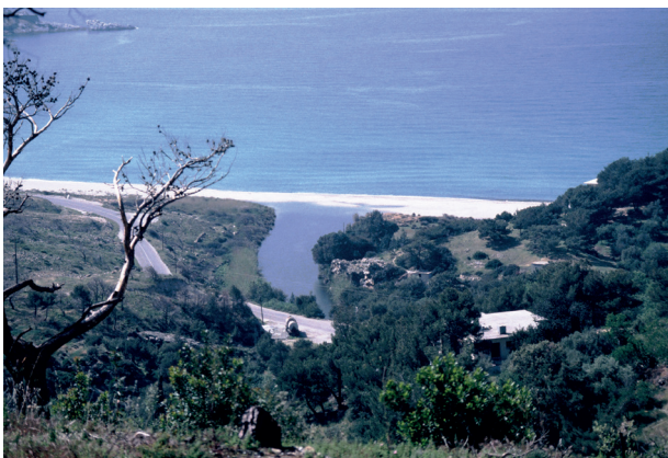
Figure 2. Ikaria-Armenistis: Due to beach wall formation, the running waters are dammed back and form suitable habitats for the Balkan Terrapin (April 1986).

Our second visit to the island in 2000 confirmed the wide distribution in the north-west at all altitudes. However, the large populations seem to have halved (Broggi 2001). With this wide distribution in the north-west clear, the species should not yet be endangered as such. Oefinger (2019) reports hand-tame terrapins feeding at the Myrsonas stream on Ikaria in June 2019 (Fig. 3). For his part, Grano (2020) notes at the same site