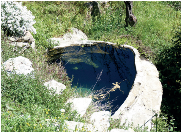
Figure 7. Open well on Kea (2011).

the natural springs are exploited. The Balkan Terrapin can also resort to using anthropogenic water accumulations such as open cisterns and sites for livestock watering (Fig. 7). However, such artificial biotopes are becoming rarer. They are replaced by closed cisterns and groundwater pumps, and the once-open waterholes for amphibians and hydrophilic reptiles are no longer maintained. The loss of open water areas is also exacerbated by ongoing climate change. In the last two decades, drying out has intensified (Fig. 6). For example, on some islands such as Lipsi, Fourni, Ithaca or Alonissos, no flowing water could be seen from April onwards. On the other hand, winter flash floods can carry turtles all the way into the sea and thus endanger their populations, as experienced in Kea (Broggi 2012). If turtles wash up in new areas, the probability of finding suitable habitats is extremely low.