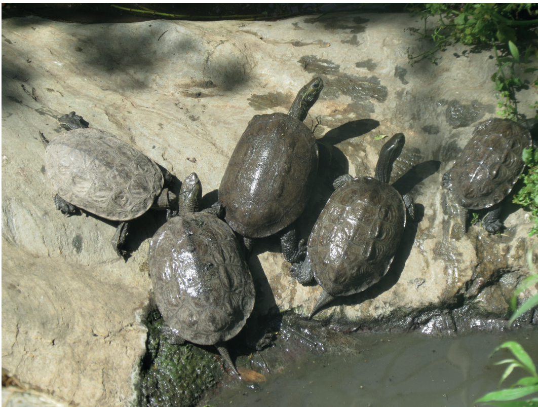
Figure 5. Mauremys rivulata in sewage water of the Chora on Kythnos (8.6.2021).