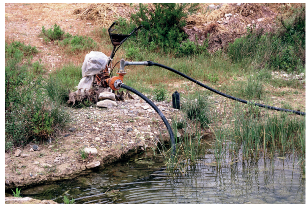
Figure 6. Water abstraction for agriculture endangers the habitats of the Balkan Terrapin (Limnos, April 2016).

In sections where there is still a long period of water retention in the watercourse, and the water in scours is retained for longer, refugial populations of M. rivulata can settle best. I have noticed such stream colonisations away from the estuary in Thassos, Samothrace, Andros, Lemnos, Kythnos, Kea and Serifos. But even in these more favourable conditions, water is being extracted for agriculture, accelerating their drying out. In addition, most of