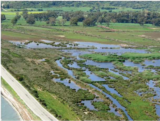
Figure 4. The Livadi Marshes on Kefalonia are the last suitable habitats for the Balkan Terrapin (16.4.2017).