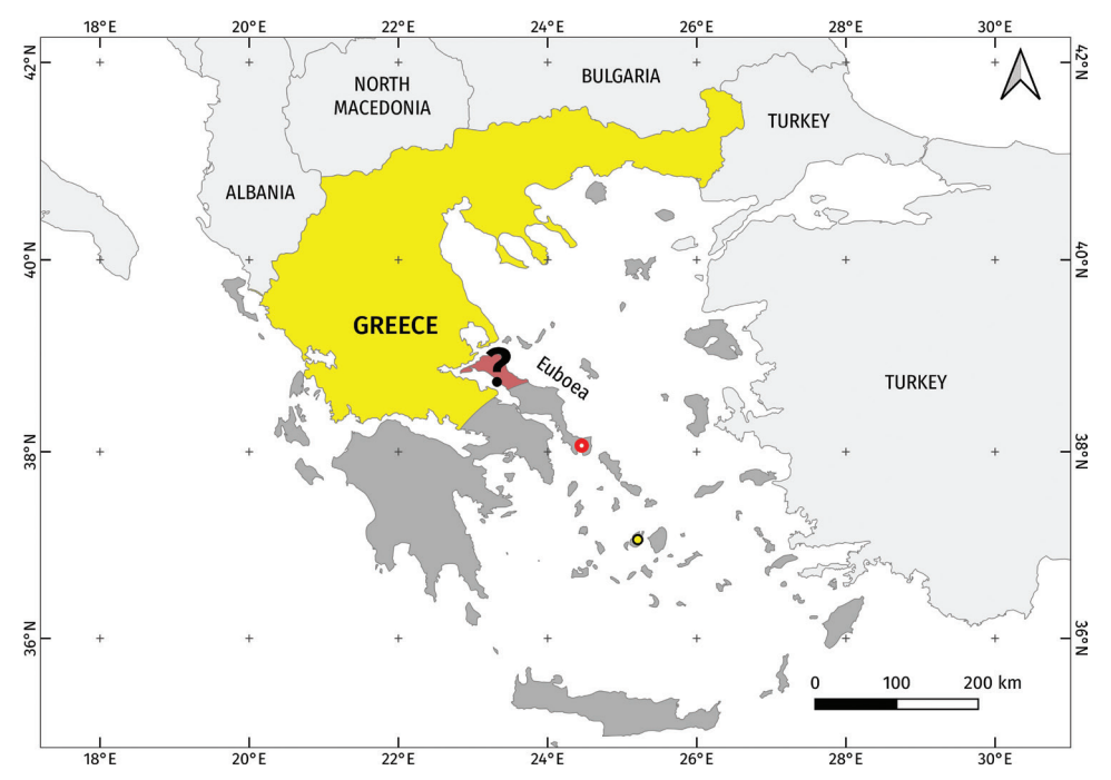
Figure 3. The distribution of Bombina variegata in Greece (yellow shading), including the new record from south Euboea Island reported here (red point). The occurrence of the species on north Euboea (red shading) is dubious.

been thoroughly surveyed (Pafilis 2010; Lymberakis et al. 2018). To the contrary, few studies focus on the mainland Greece and, thus, our knowledge on the continental herpetofauna remains poor (e.g. Annousis et al. 2021; Christopoulos 2022). As such, new entries in the herpetofauna of Euboea have been added during the last few years