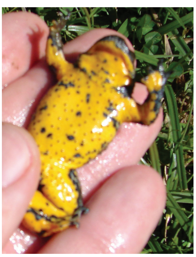
Figure 2. Adult Bombina variegata (Linnaeus, 1758) (ZMUA 4000) from south Euboea, Greece.