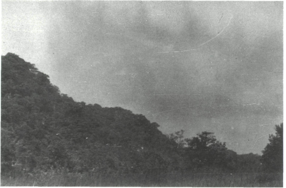
Fig. 2: The tropical rain forest at Cuc Phuong National Park.