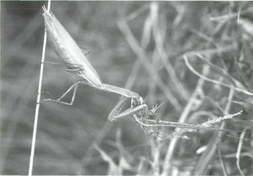
Figs. 1 & 2: Praying Mantis ( Mantis religiosa ) feeding on a juvenile Sand Lizard ( Lacerta agilis ). Abb. 1 & 2: Gottesanbeterin ( Mantis religiosa ) beim Verzehr einer juvenilen Zauneidechse ( Lacerta agilis ).