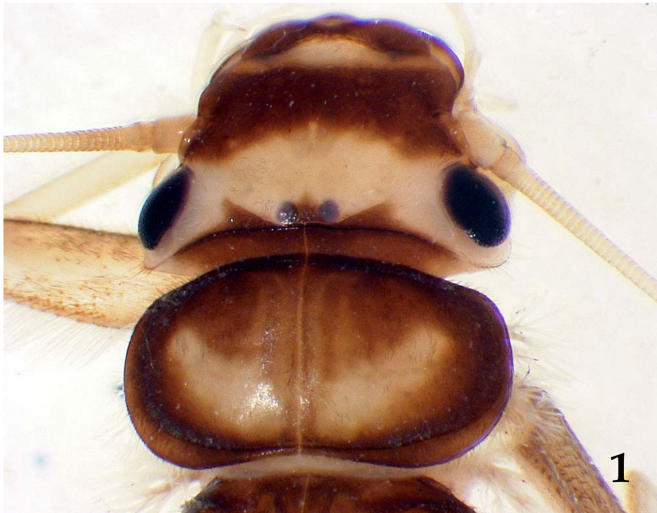
Fig. 1. Neoperla sp. larva. Head and pronotum, dorsal view.