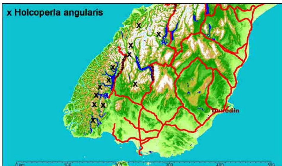
Fig. 7. Distribution of Holcoperla angularis on the South Island of New Zealand.