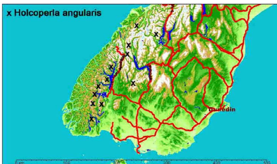
Fig. 7. Distribution of Holcoperla angularis on the South Island of New Zealand.