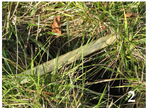
Fig. 2. Closeup of stream with 30cm ruler.

Monthly benthic samples of larvae were collected from Outgate Beck during the flow interval from 1993 to 2008, except for the water years 1999-2000 and 2000-2001. A small soil scoop was used to disturb the substrates (mostly grass debris) in front of the collecting net. The net and substrate samples were washed over a 0.5 mm mesh sieve. The sieve was submerged in a pan of water overnight and live larvae were picked from the debris with forceps the following day. Small larvae that crawled through the