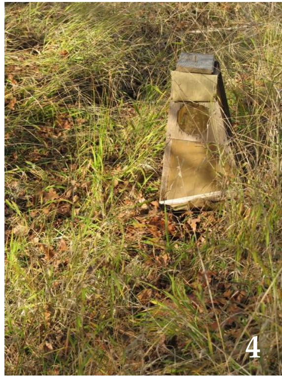
Fig. 3. Outgate Beck, looking downstream to the emergence trap; about half the length of the study section. Fig. 4. Emergence trap closeup.

sieve were readily collected because they were separated from the debris. Larvae were preserved in 70-80% ethanol.