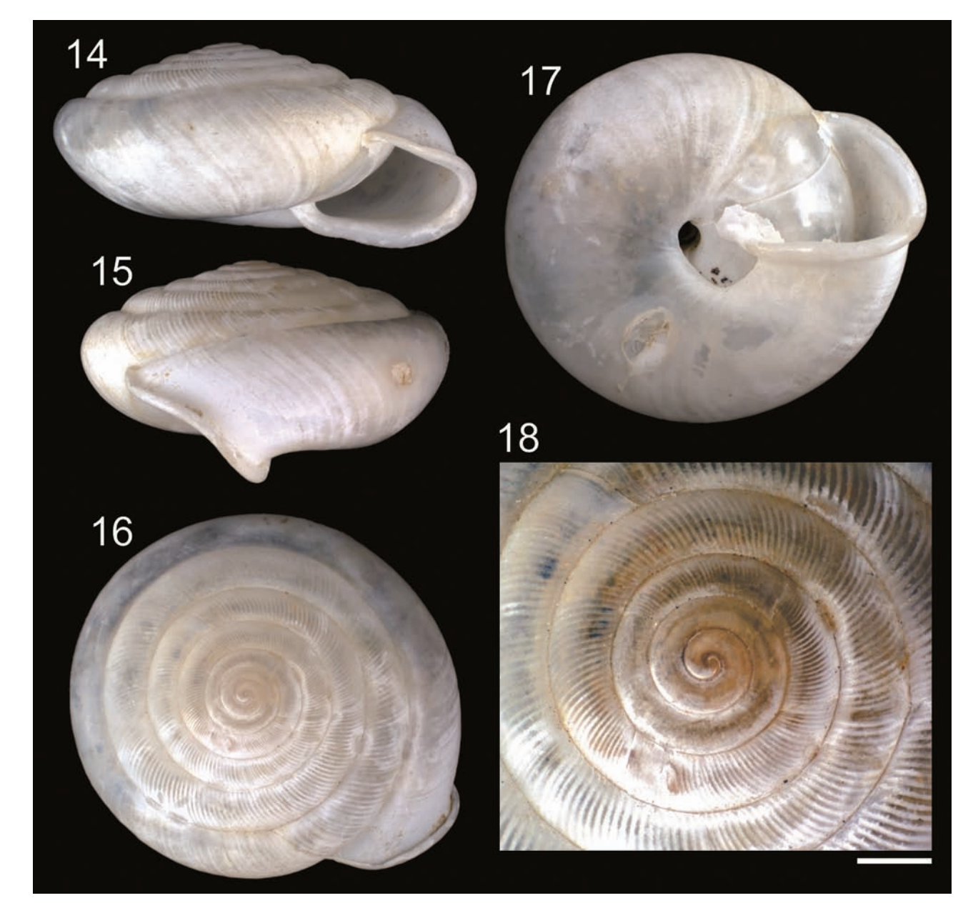
Figs. 14–18. Streptaxis leirae sp. nov. Holotype, MZSP 129247 (H = 6.8 mm, D = 13.5 mm). The scale bar (= 1 mm) refers only to the close-up image of the protoconch and first whorls.

growth). All of the present specimens were collected under bushes in a dune area, indicative of a dry sandy habitat for this species. The present record greatly extends the species' range to the east.