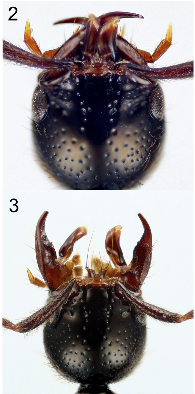
Figures 1–3. Yunnaniella mandian n. gen., n. sp. – 1. Habitus (total length: 5.7 mm). 2–3 Head in dorsal view, 2 mandibles closed, 3 mandibles opened.