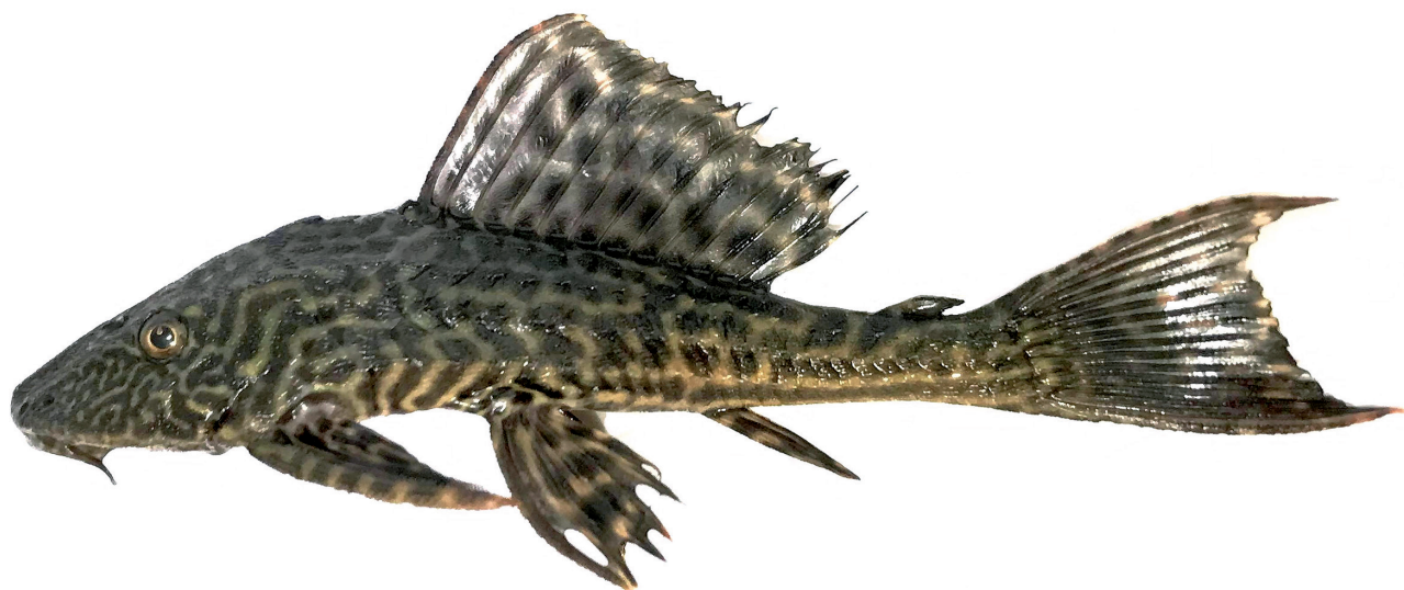
Fig. 2. Male of Pterygoplichthys pardalis (Castelnau, 1855) from the Shatt al-Arab River, Basrah, Iraq; 132.6 mm TL.

SAMAT et al. (2016) found that the Amazon sailfin catfish reaches maturity at 125 mm and 130 mm SL for males and females, respectively. With a size range of 125.7 to