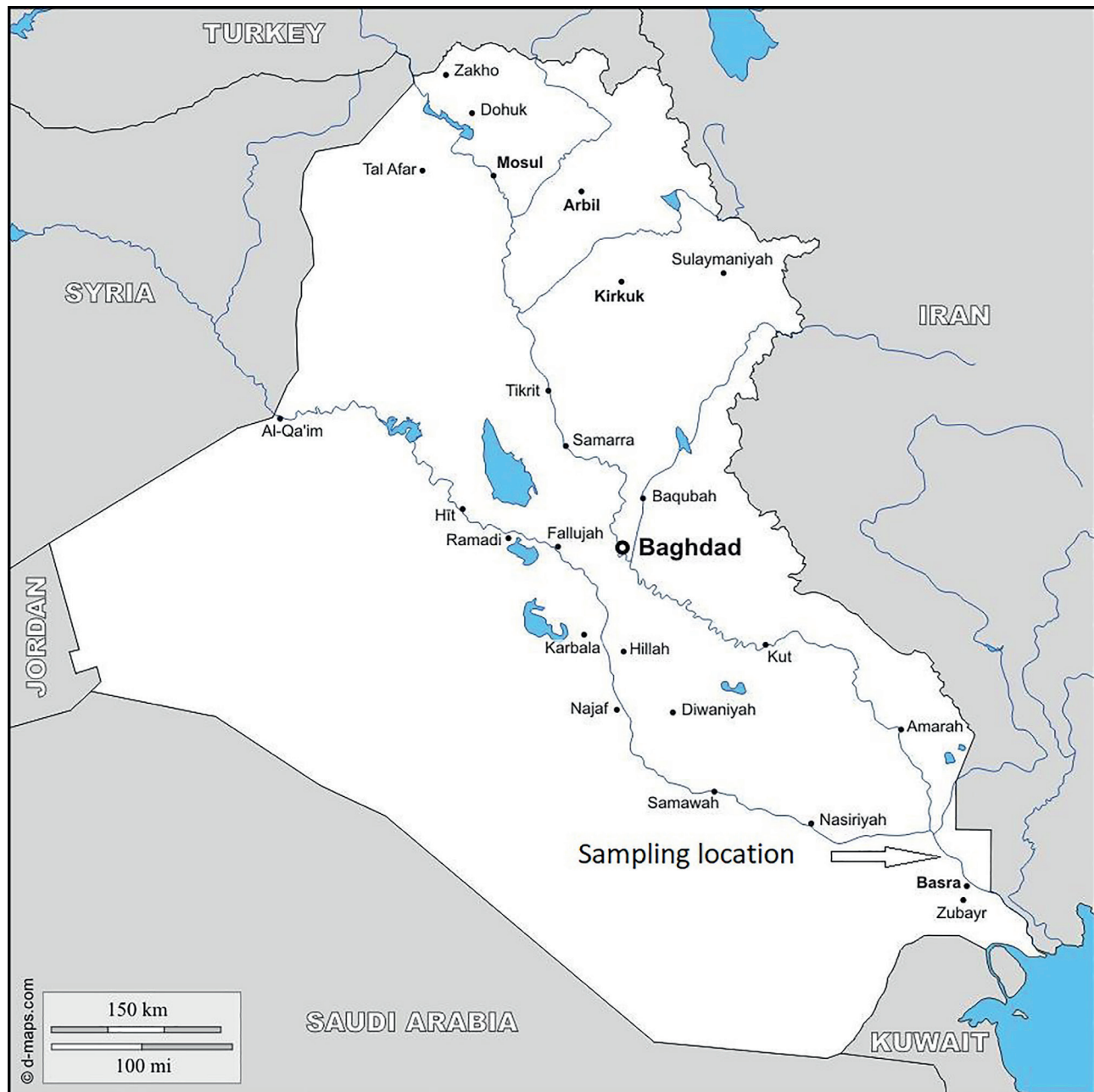
Fig. 1. Map showing the locality of collection (arrow) of Pterygoplichthys pardalis (Castelnau, 1855) in the Shatt al-Arab River, Basrah, southern Iraq.

The present study reports on the presence of the Amazon sailfin catfish in the Shatt al-Arab River at Basrah, Iraq, where 175 individuals of P. pardalis were collected in 2017. This is the first record of this species from the freshwater system of Iraq in general and from the Shatt al-Arab River in particular.