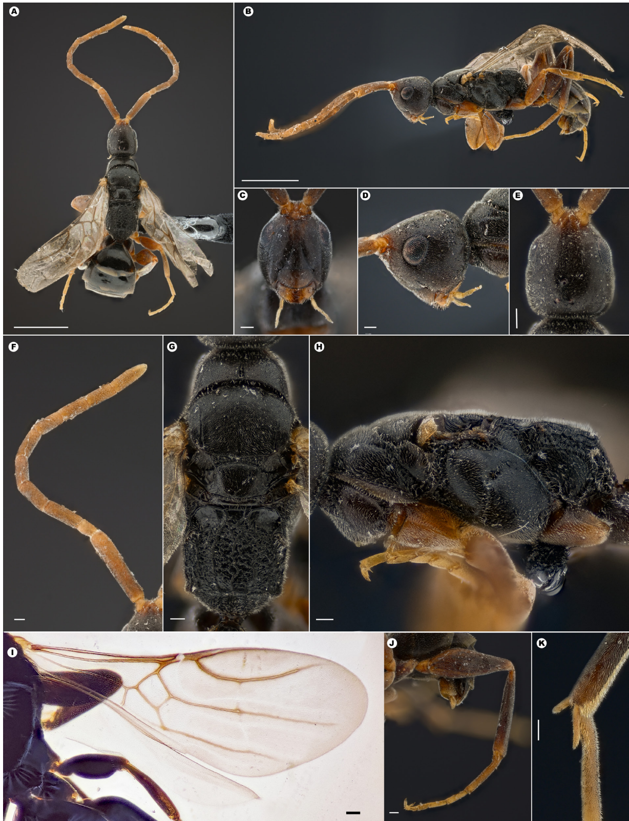
Fig. 2. Ampulicomorpha nepalensis Olmi, 1997, female. A. Habitus, dorsal view. B. Habitus, lateral view. C. Head, frontal view. D. Head, lateral view. E. Head, dorsal view. F. Antenna. G. Thorax, dorsal view. H. Thorax, lateral view. I. Wings. J. Hind leg. K. Hind tibial spurs. Scales bars: 1.0 mm (A, B), 0.1 mm (C–K).