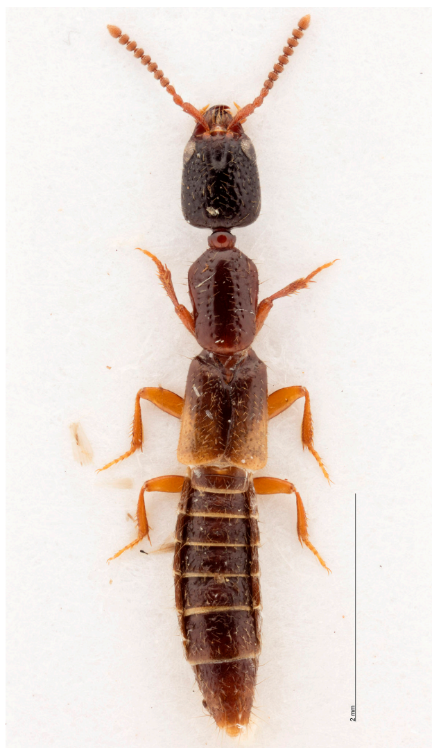
Fig. 17. Elapheia gracilenta (Scheerpeltz, 1974); male from South Africa (SMNS), dorsal habitus. Scale bar: 2 mm.