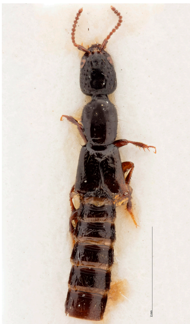
Fig. 13. Phacophallus capensis sp. n.; holotype ♂ (SMNS), dorsal habitus. Scale bar: 2 mm.