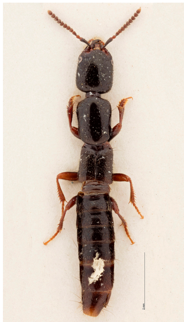
Fig. 14. Notolinopsis complicitus sp. n.; holotype ♂ (SMNS), dorsal habitus. Scale bar: 2 mm.