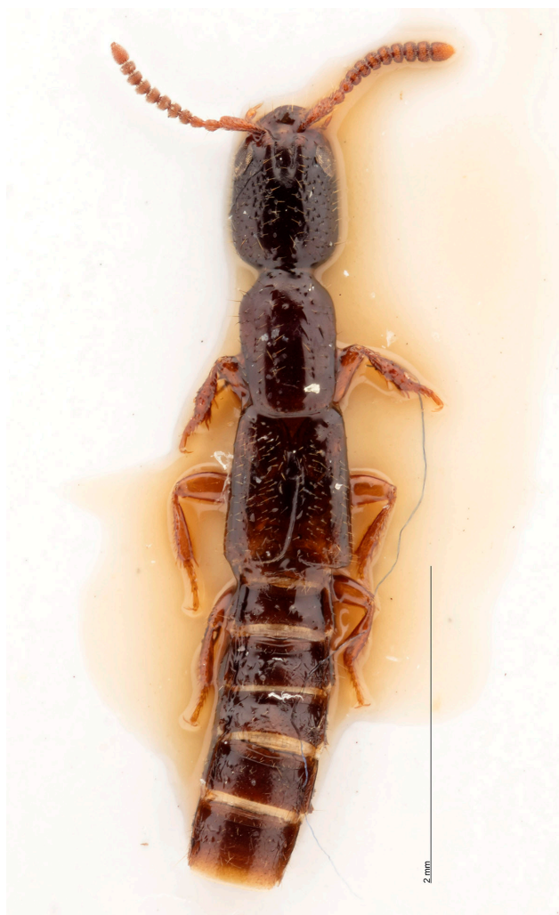
Fig. 15. Elapheia zuluensis sp. n.; holotype ♂ (SMNS), dorsal habitus. Scale bar: 2 mm.

series of 10–11 punctures and lateral series of 5 anterior punctures. Elytra shorter and narrower than pronotum, with more or less obsolete humeral angles; surface with very fine punctation, arranged in some series. Abdomen with traces of transverse micro-striation and fine punctures on the sides of each segment.