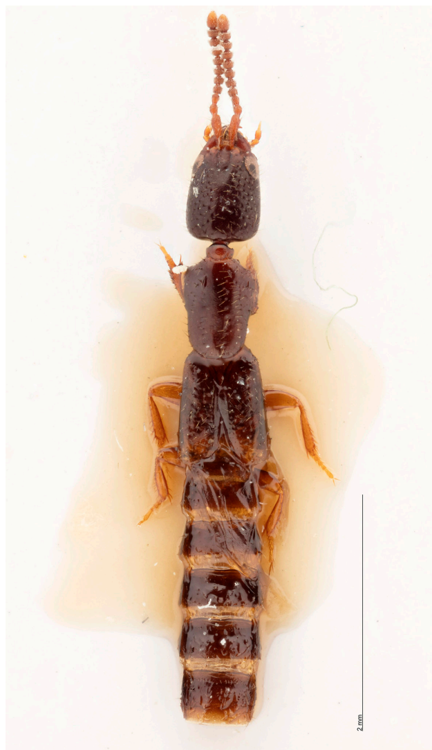
Fig. 16. Elapheia natalensis sp. n.; holotype ♂ (SMNS), dorsal habitus. Scale bar: 2 mm.

Paratypes : same data, SW Magudu, 27°34'S, 31°35'W, 4–5.I.2009, P. SCHÜLE, 1 ♀ (SMNS), 1 ♂ (cB).