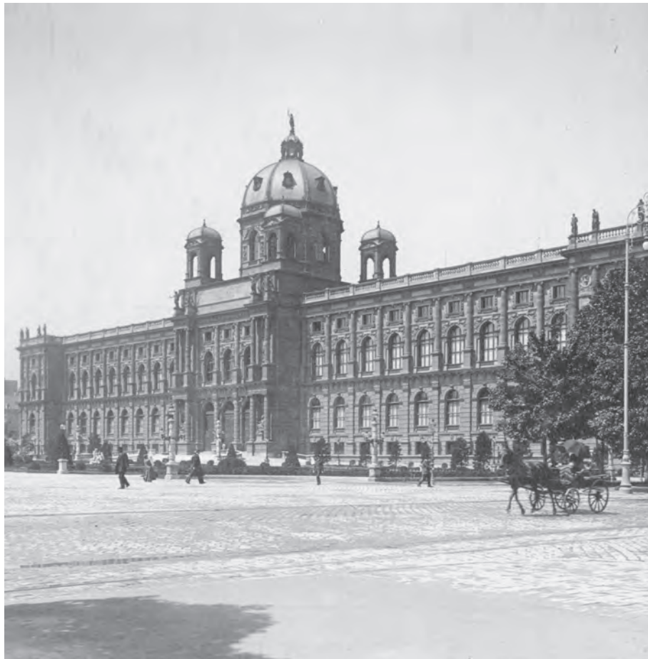
Text-Fig. 1. Facade of the Museum of Natural History Vienna in the late 19 th century.

The upper ground floor of the Natural History Museum Vienna (Text-Fig. 1) houses 19 halls with mineralogical, palaeontological, prehistoric and anthropological exhibitions and a lecture room. The decorations were – according to Gottfried Semper’s “Gesamtkunstwerk” (SEMPER & SEMPER, 1884; EGGERT, 1978) – not only in perfect tune with the museum’s principal purpose but also in closest relation to the collections displayed. All rooms were decorated with paintings and five of them (in the corners and the central hall) with additional “caryatides”. According to HOCHSTETTER (1884), the idea stemmed from Carl Hasenauer, but Semper already made very detailed plans much earlier (JOVANOVIĆ-KRUSPEL & SCHUMACHER, 2014: 132f.). Altogether 111 paintings of landscapes, famous buildings, ethnographic scenes and primeval eras illustrate and explain the exhibitions. Their content was in Hochstetter’s responsibility. Already in June 1882 the awarding of contracts for the wall-pictures started. On 5 th September, the final commissioning was on the agenda (JOVANOVIĆ-KRUSPEL & SCHUMACHER, 2014: 162). Many of the paintings (al-