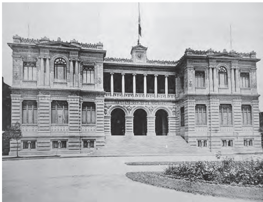
Text-Fig. 3. Facade of the Museum of Geology (Anonymous, Gelatin-silver plate. Photographic archive of the Division of Graduate Studies of the ENAP, San Carlos).

Inside the institute’s building, the collections of minerals and fossils were exhibited on the ground level. This space was conceived as a museum exhibition of many geological objects, from minerals to fossil specimens. The upper lev-