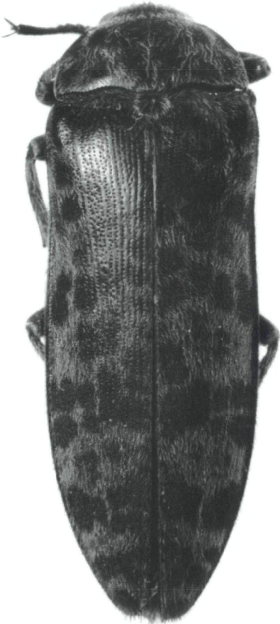
Fig 1: Habitus of Eulichas milleri