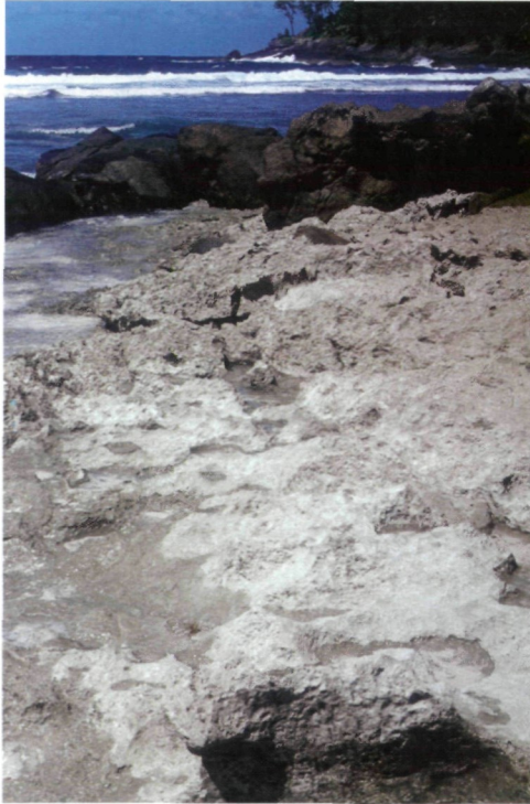
Fig. 10: Habitat of Hyphalus madli sp.n. at the type locality (Anse Lascars, Silhouette Island, Seychelles).

DISTRIBUTION: So far only known from the type locality.