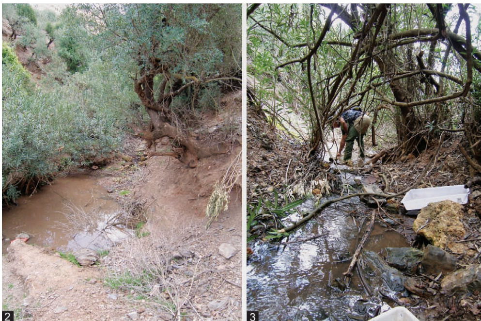
Figs. 2–3: Type locality of Limnebius zaerensis sp.n., affluent of the river Korifla near Rommani, Pays Zaër-Zaïane, Morocco.

Aedeagus (Fig. 1). Main piece broad, flattened, not twisted, with a deep incision forming two lobes of unequal size. Left paramere short and wide, distinctly separate from the main piece, covered with a dense tuft of setae, and a few long apical setae. Appendage “A” of JÄCH (1993) enlarged and flattened apically.