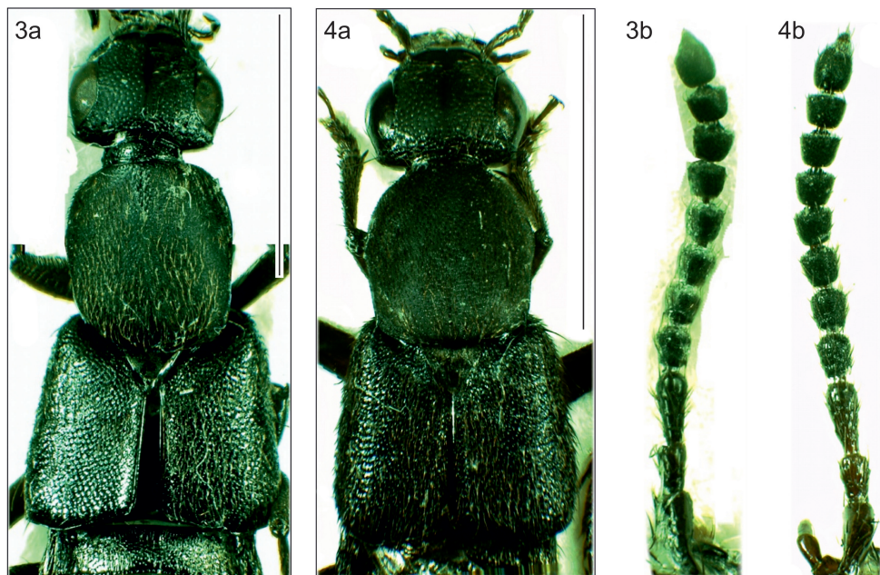
Figs. 3–4: 3) Philothalpus pecki and 4) P. brasiliensis ; a) forebody, b) antenna. Scale bars: a: 5 mm, b: 1 mm.

ETYMOLOGY: The name of the species (an adjective) refers to the country, where it was collected.