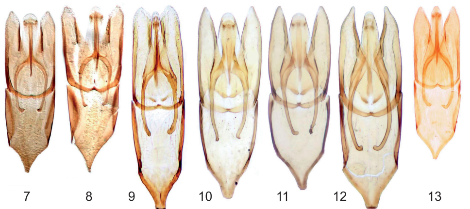
Figs. 7–13: Aedeagi. 7) Helophorus altosichuanensis , holotype; 8) same, paratype; 9) H. praenanus , China, Qinghai, Gangca; 10) H. parajacutus , paratype, Mongolia, Khentii Province; 11) H. aquila , holotype, China, Qinghai, Gangca; 12) H. frater , China, Qinghai, upper Huang He; 13) H. shatrovskyi , paratype, Mongolia, Bayankhongor Province. Scale = 0.5 mm.

the size and shape of the aedeagus is most like that of H. shatrovskyi ANGUS, 1985 (Fig. 13), though the external morphology is very different.