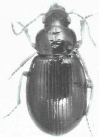
Photograph of habitus of Bradycellus nepalensis nepalensis ssp. nov. (paratype).

Styli: Shape of styli in lateral view as figured (figs. 2 and 8).