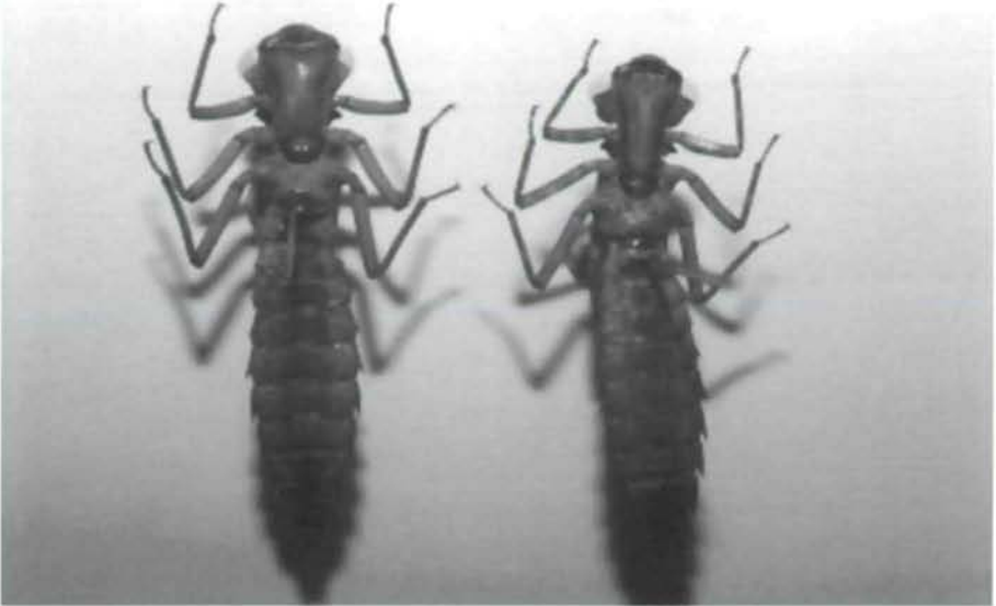
Fig. 11: Comparison of Austrophlebia larval exuviae (female): A. costalis (TILLYARD) = exuviae with narrow labium; - A. subcostalis sp. n. = exuviae with wide labium.