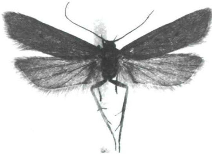
Fig. 1: Acompsia delmastroella spec. nova (holotype).

The lepidoptera communities of the montane, subalpine and alpine zones are still insufficiently explored and numerous new species were recognized during the last two decades. Most of the endemic fauna is restricted to the southern part of the Alps and largely unexplored areas still make the discovery of new species very likely. Altogether about one third of the endemic species of the Alps was described since 1980 (HUEMER 1998). Species of the genus Acompsia seem to have numerous strongly restricted mountainous endemics with only two more widely distributed species ( A. tripunctella and A. cinerella ). A. delmastroella spec.nova perfectly supports this hypothesis. Other examples with an unproportional high portion of alpic endemics are found e.g. in the genera Kessleria NOWICKI (Yponomeutidae), Sattleria POVOLNÝ (Gelechiidae) or Erebia DALMAN (Nymphalidae).