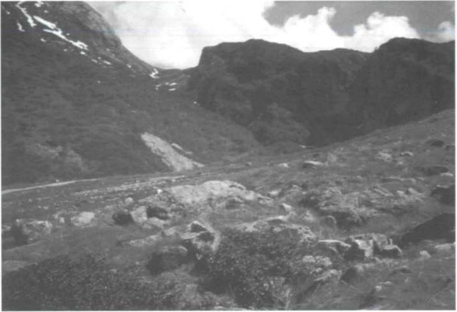
Fig. 18: Habitat of Acompsia delmastroella spec. nova (photo G.B.Delmastro).