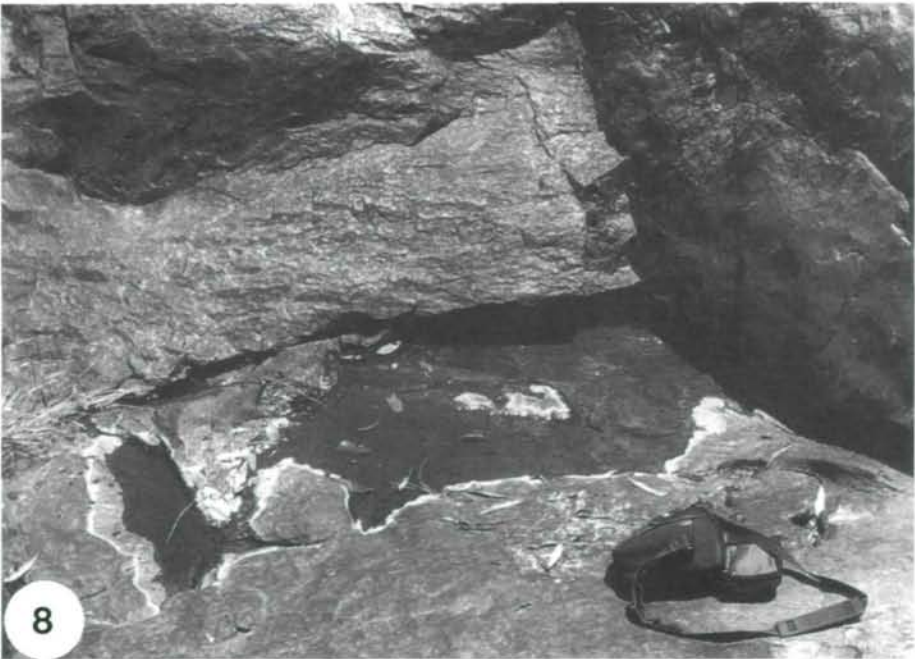
Fig. 8: Habitat of Hydroglyphus balkei sp.n., locality 12: Gunlom Waterfall Creek.