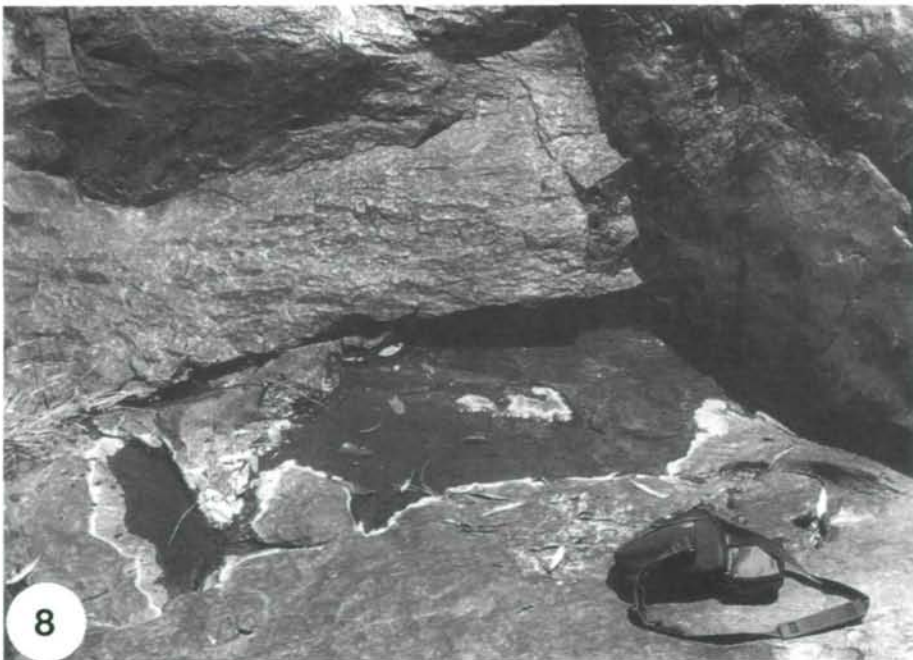
Fig. 8: Habitat of Hydroglyphus balkei sp.n., locality 12: Gunlom Waterfall Creek.