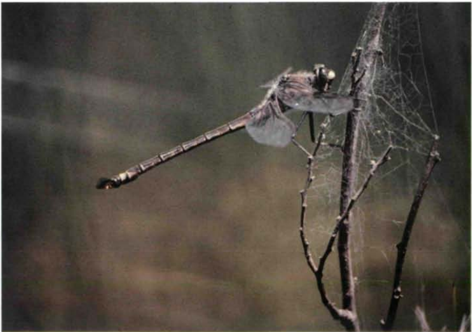
Photo 2: Petalura gigantea LEACH ♂: Burrawang, NSW