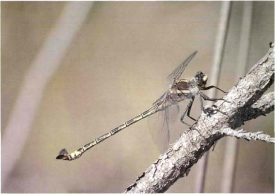
Photo 1: Petalura litorea sp. n. ♂: N. Stradbroke Island, Old