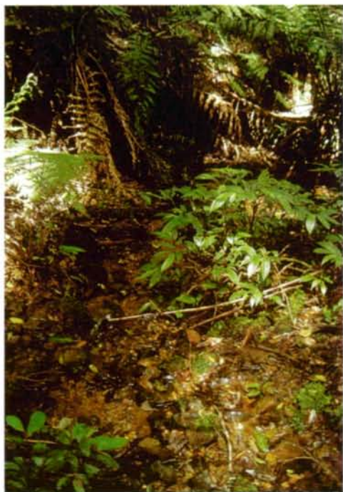
Photo 2. Habitat of Eusynthemis ursula THEISCHINGER at Whitehouse Creek, Chichester State Forest, New South Wales