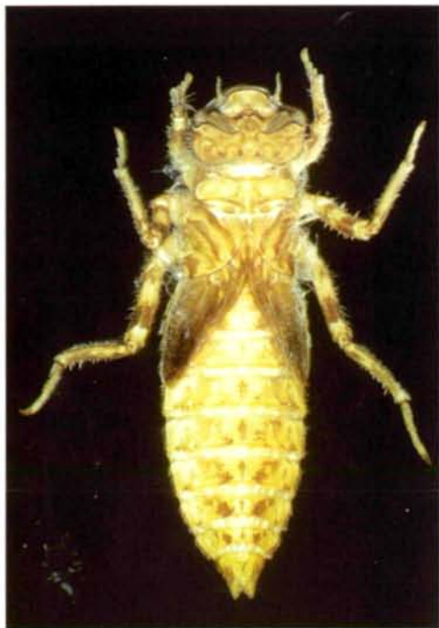
Photo 1. Final instar larva of Eusynthemis ursula THEISCHINGER