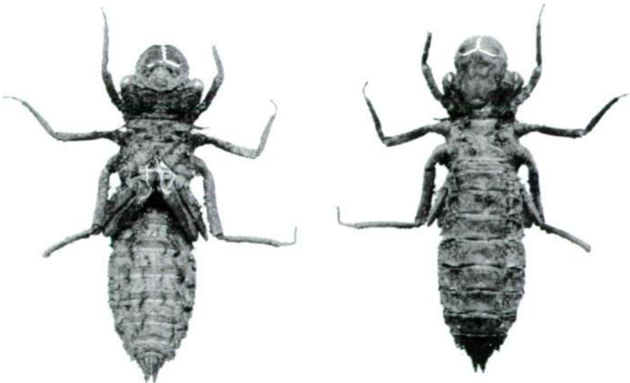
Photos: Choristhemis olivei (TILLYARD), final instar exuvia: (left) dorsal; (right) ventral.