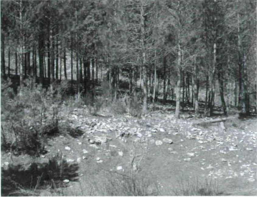
Fig. 13: Type locality of Astenus segurae sp. n.