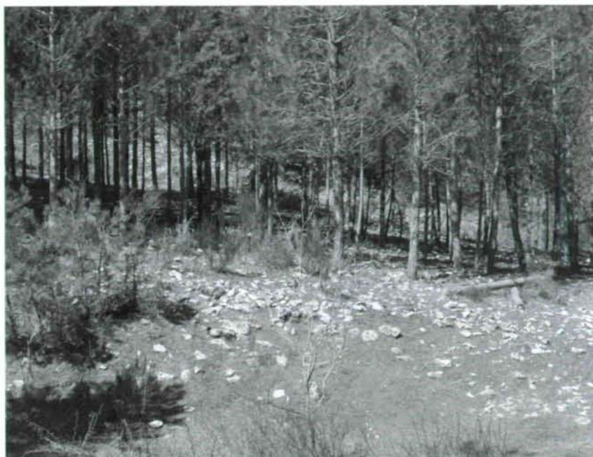
Fig. 13: Type locality of Astenus segurae sp. n.