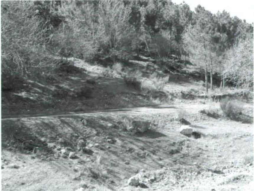
Fig. 14: Type locality of Astenus alcarazae sp. n.