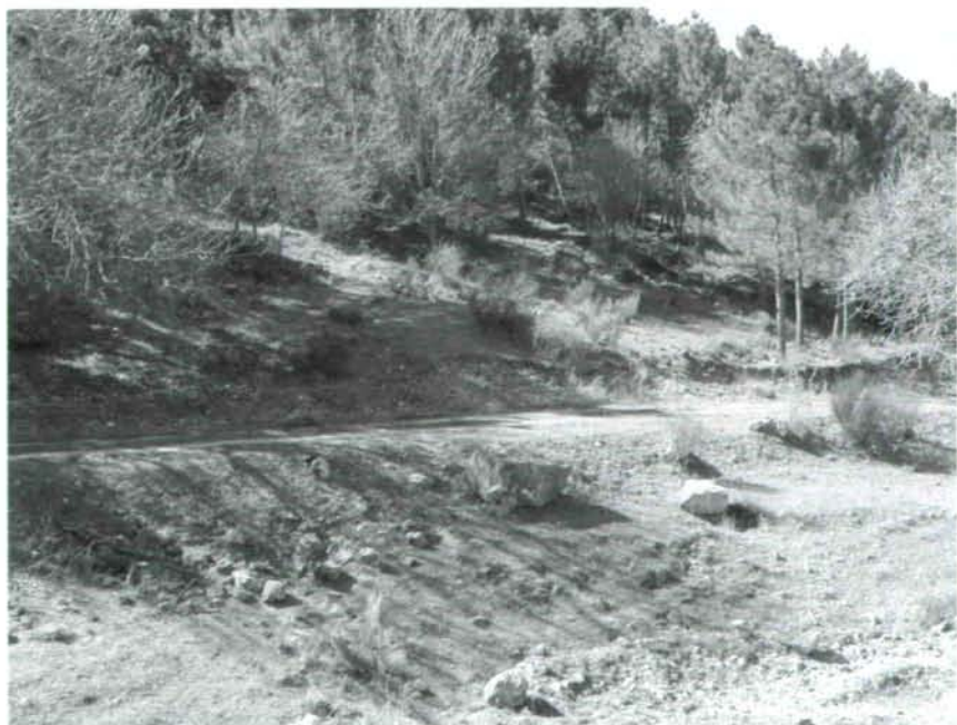
Fig. 14: Type locality of Astenus alcarazae sp. n.