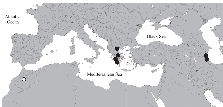
Map 1: Distributions of Dictyon pumilio (EPPELSHEIM) (filled circles) and D. hlavaci nov.sp. (open circles) in the Western Palearctic region.

The two females from Greece were collected from a dead beech trunk inhabited by the ant Lasius fuliginosus (LATREILLE 1798).