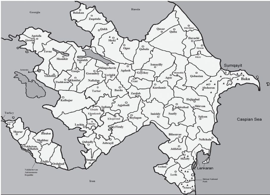
Figure 1. Map of Azerbaijan Republic: ○ – destinations; ▲ – material collected area