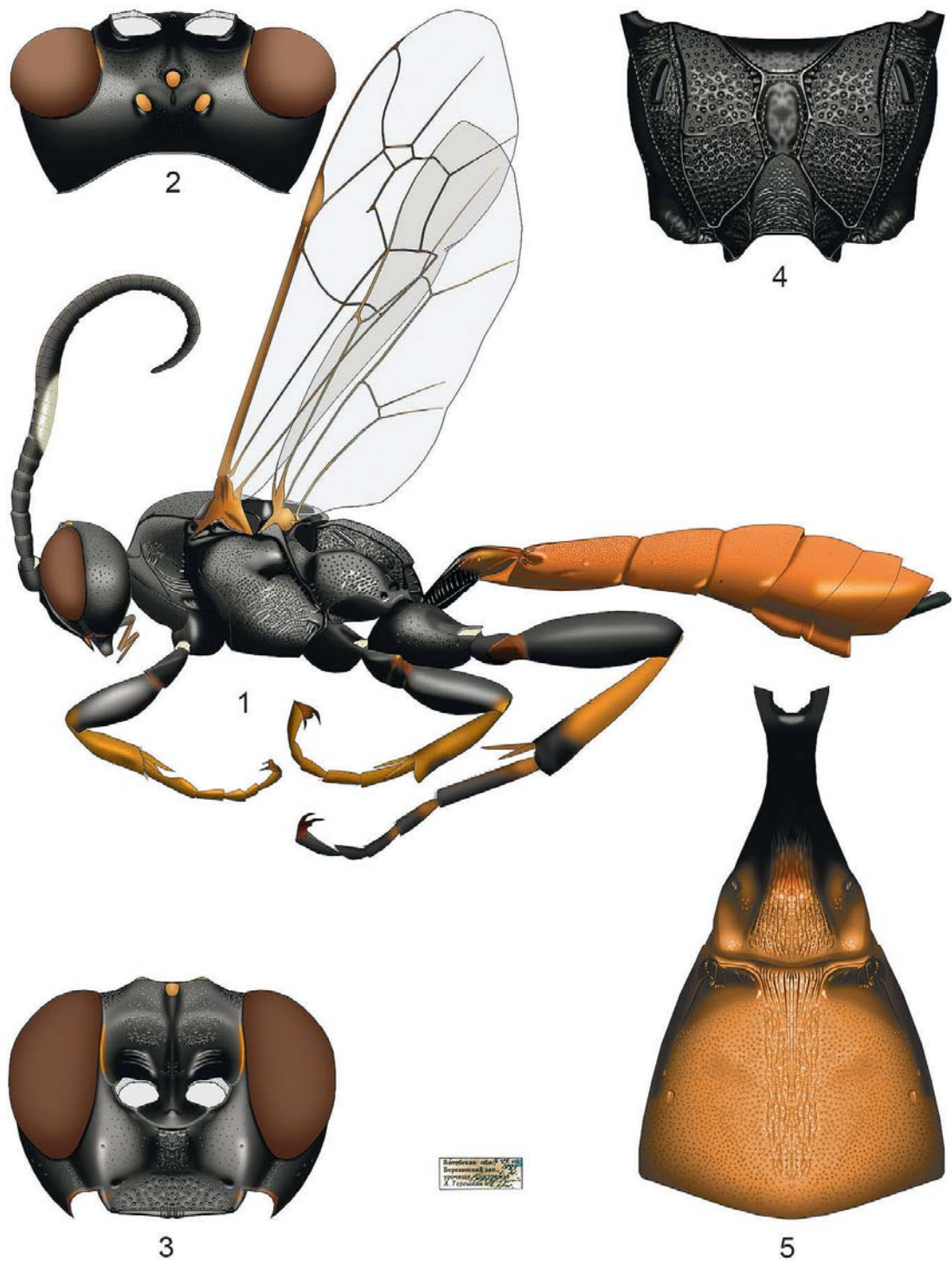
Plate 1: Coelichneumon torsor (THUNBERG), ♀.