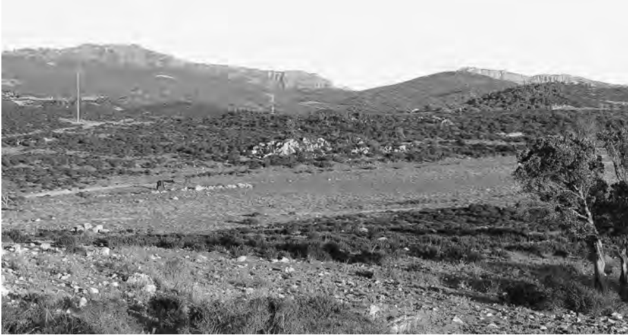
Fig. 10: Type locality of Astenus wunderlei nov.sp.

Distribution and natural history: The type locality is situated to the southwest of Dorgali near the east coast of Sardinia. The specimens were collected from under stones, one of them in a nest of Tetramorium sp., in a stony pasture at an altitude of 740 m (Fig. 10).