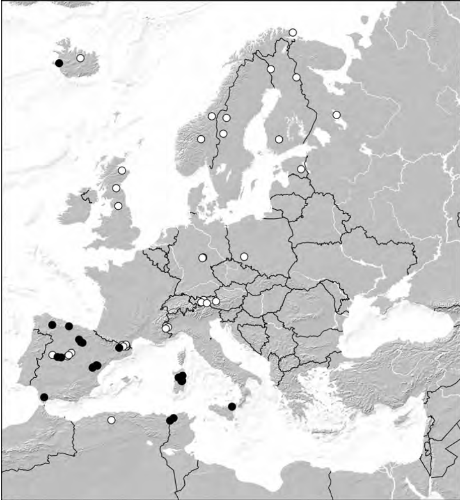
Map 1: Distribution of Oxypoda islandica Kraatz based on examined (filled circles) and selected literature records (open circles).

Distribution and natural history: Leptusa meybohmi is currently known only from two localities near Lanusei in the northeast of Sardinia. The specimens were sifted from leaf litter in an oak forest and under bushes and Quercus ilex at altitudes of 900 and 340 m, respectively (MEYBOHM pers. comm.). The low altitudes suggest that the species may be more widespread in the island.