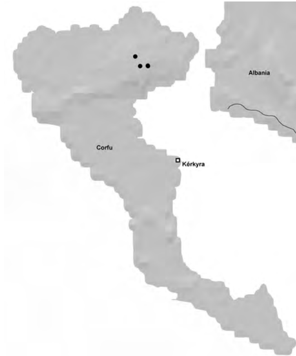
Map 1: Records of Quedius hellenicus on Corfu (black circles).