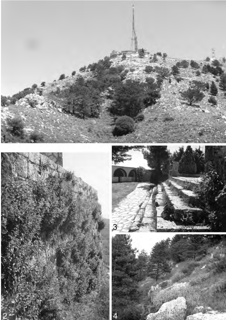
Figs 1-4: Oros Pantokratoras: (1) west slope (above); (2) north wall of monastery on summit (lower left); (3) yard on the north side of monastery (mid-right); (4) north slope of Pantokrator below summit (lower right).