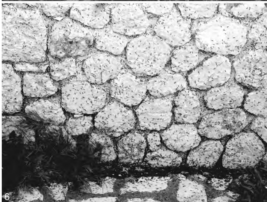
Figs 5-6: Monastery on summit of Oros Pantokratoras on 1 June, 2017: northwestern monastery wall with numerous specimens of Quedius hellenicus .