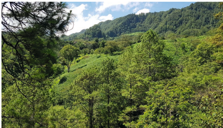
Fig. 8: Locality of Trogoderma aritae nov.sp.: Honduras, La Paz, San Pedro de Tutule, La Chanchera, with the tree Pinus oocarpa SCHIEDE ex SCHLECTENDAHL, 1838 (Pinaceae), (photo by Gabriela Arita).

Differential diagnosis: The Central America contains following countries: Belize, Guatemala, Honduras, El Salvador, Nicaragua, Costa Rica and Panama. The genus Trogoderma recorded in Central America includes 10 species (see table 1), nine species were introduced within stored products or other commodities. The new species is similar to T. beali MROCKOWSKI, 1968 (Costa Rica), but differs from it by the bicolorous elytral cuticle ( beali – elytral cuticle is only black). Other similar species as T. grassmani BEAL, 1954 (Mexico, U.S.A) and T. okumurai BEAL, 1964 (U.S.A) differ from the new species by the structure of antennae and elytral colour patterns (figs 6-7).