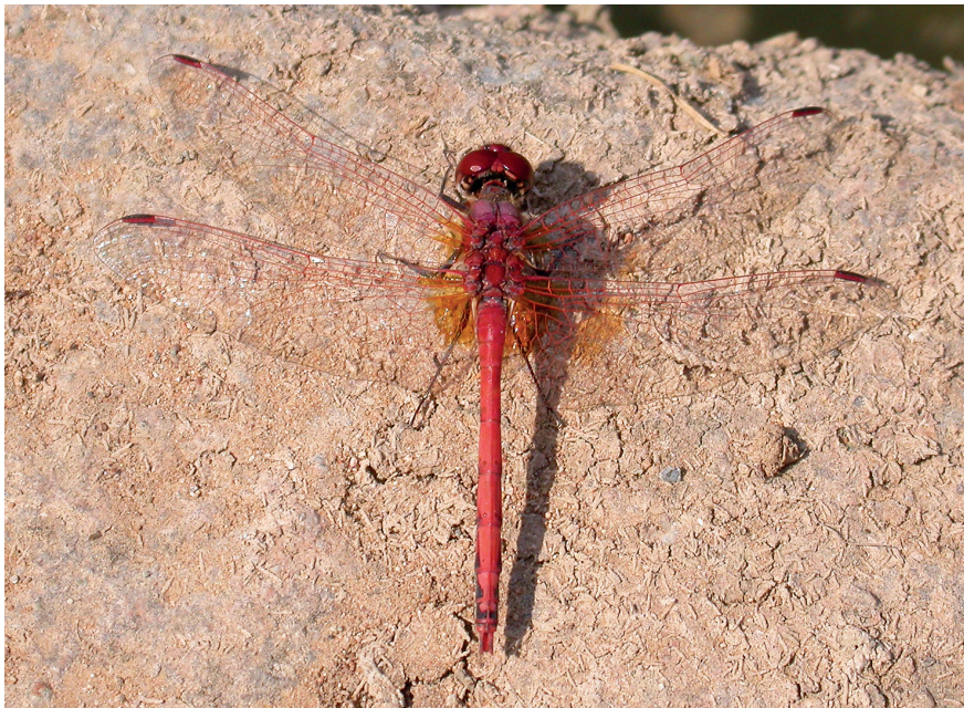
Figure 4. Livera/Sadrazamköy water tank, a Trithemis arteriosa ♂ on the top of the wall of the water tank, 16-viii-2004. – Abbildung 4: Livera/Sadrazamköy Wasserbehälter, Trithemis arteriosa ♂, 16.08.2004.