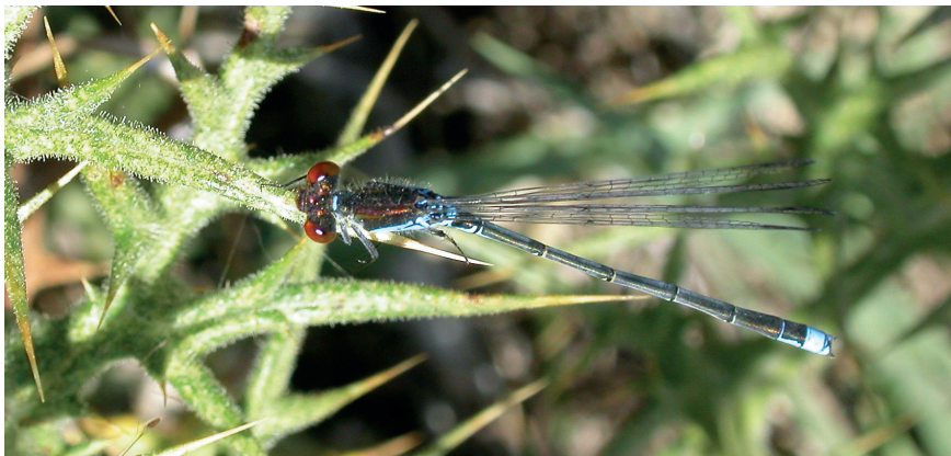
Figure 3. Fotta/Dağyolu dam, an Erythromma viridulum ♂ perching on vegetation at the water's edge, 25-v-2004. – Abbildung 3: Fotta/Dağyolu Stausee, ein Erythromma viridulum ♂ am Ufer, 25.05.2004.

Recorded from 16 localities: 13 dams, two natural wetlands, and a water treatment works. Numerous at nine dams and mating/ovipositing observed at seven. 35 records: June–July 2003 and mid–late January to late September 2004. In detail: Loc 1 several; Loc 4ab several; Loc 10b several; Loc 10f several; Loc 10g several; Loc 11a several; Loc 11b one; Loc 11d fairly common and mating pairs; Loc 11e one; Loc 11h fairly common; Loc 12d fairly common; Loc 14c tandem pair ovipositing; Loc 14d several; Loc 14f fairly common; Loc 15a two; Loc 16a common; Loc 17 fairly common; Loc 18a ten; Loc 20a very common; Loc 20b