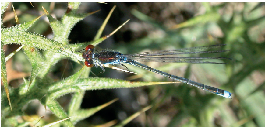
Figure 3. Fotta/Dağyolu dam, an Erythromma viridulum ♂ perching on vegetation at the water's edge, 25-v-2004. – Abbildung 3: Fotta/Dağyolu Stausee, ein Erythromma viridulum ♂ am Ufer, 25.05.2004.

Recorded from 16 localities: 13 dams, two natural wetlands, and a water treatment works. Numerous at nine dams and mating/ovipositing observed at seven. 35 records: June–July 2003 and mid–late January to late September 2004. In detail: Loc 1 several; Loc 4ab several; Loc 10b several; Loc 10f several; Loc 10g several; Loc 11a several; Loc 11b one; Loc 11d fairly common and mating pairs; Loc 11e one; Loc 11h fairly common; Loc 12d fairly common; Loc 14c tandem pair ovipositing; Loc 14d several; Loc 14f fairly common; Loc 15a two; Loc 16a common; Loc 17 fairly common; Loc 18a ten; Loc 20a very common; Loc 20b