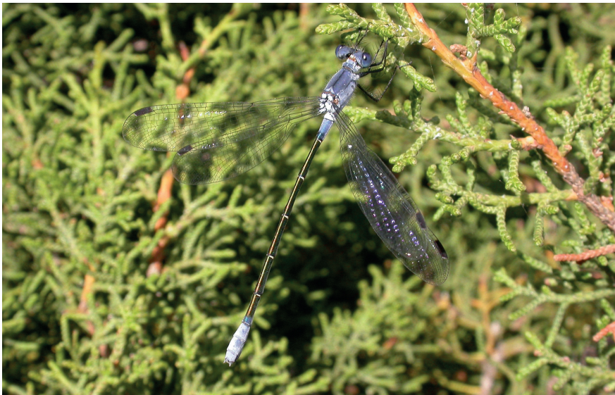
Figure 2. Cape Andreas, a migrant Lestes macrostigma resting on vegetation, 27-iv-2004. – Abbildung 2. Cap Andreas, ein in der Vegetation ruhender Migrant von Lestes macrostigma, 27.04.2004.

Recorded from 22 localities: 13 dams, three streamlets, a water treatment works, a garden pond, a pool/ditch, a brackish coastal wetland, a natural freshwater wetland, and an area of reeds. Numerous at eight dams (mating observed at two) and at a freshwater wetland. One instance of cannibalism was observed. 32 records: mid June 2003 and mid March–late September 2004. In detail: Loc 1 four; Loc 2 several; Loc 4a several; Loc 7a several; Loc 8a one; Loc 10c very common; Loc 10e common and mating; Loc 10f several; Loc 10g several, including one