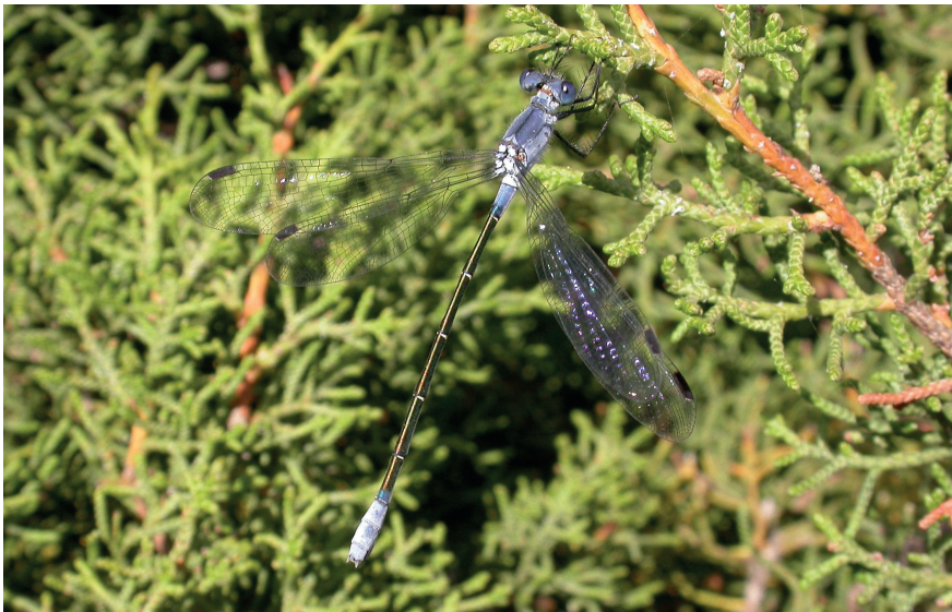
Figure 2. Cape Andreas, a migrant Lestes macrostigma resting on vegetation, 27-iv-2004. – Abbildung 2. Cap Andreas, ein in der Vegetation ruhender Migrant von Lestes macrostigma, 27.04.2004.

Recorded from 22 localities: 13 dams, three streamlets, a water treatment works, a garden pond, a pool/ditch, a brackish coastal wetland, a natural freshwater wetland, and an area of reeds. Numerous at eight dams (mating observed at two) and at a freshwater wetland. One instance of cannibalism was observed. 32 records: mid June 2003 and mid March–late September 2004. In detail: Loc 1 four; Loc 2 several; Loc 4a several; Loc 7a several; Loc 8a one; Loc 10c very common; Loc 10e common and mating; Loc 10f several; Loc 10g several, including one