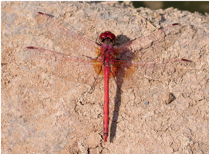
Figure 4. Livera/Sadrazamköy water tank, a Trithemis arteriosa ♂ on the top of the wall of the water tank, 16-viii-2004. – Abbildung 4: Livera/Sadrazamköy Wasserbehälter, Trithemis arteriosa ♂, 16.08.2004.