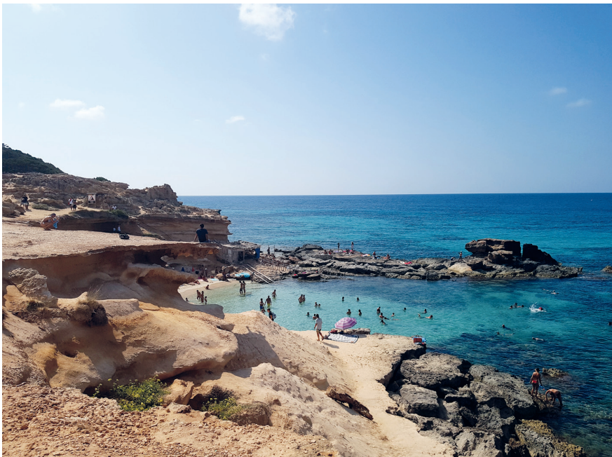
Figure 2. Habitat where Anax parthenope were observed flying in Calò Des Mort (38.659722° N, 1.518056° E), 1-ix-2018. – Abbildung 2: Beobachtungsort von A. parthenope, 01.09.2018.

On 31 August 2018 from 21:30 to 22:45 h CEST (daily ambient temperature maxima < 29°C, no wind, clear), a group of A. parthenope was observed containing several hundred individuals, starting at the foot of the cliff and extending through it. The dragonflies swarm in the surroundings of the Calò Des Mort (38.65972° N, 1.51805° E, 12 m a.s.l.), flew from the base to the cliff's interior in the juniper forest and out again. The group, which was composed of both sexes, was observed in a space of 2,000 × 200 m from the cliff and in adjacent forest areas. On 1 September 2018 from 14:00 to 15:00 h CEST, a group of A. parthenope was observed on the Calò Des Mort containing less than thirty individuals. Only a few of them flew at sunset. On 2 September 2018 from 21:30 to 22:45 h CEST, only a male of A. parthenope was observed.