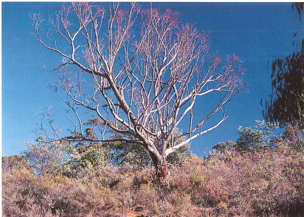
Plate 1. Dead tree of Eucalyptus goniocalyx F. Muell. (Myrtaceae), larval host plant for Nascio vetusta (Boisduval), Hill End, New South Wales. (Photo: J. R. TURNER).