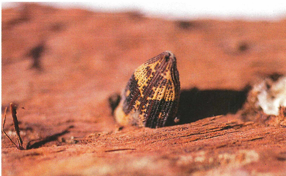
Plate 2. Dead adult of Nascio vetusta (Boisduval) in the dead wood of Eucalyptus goniocalyx F. Muell., Hill End, New South Wales.