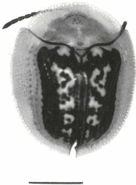
Fig. 1. Cassida compuncta (Boheman) adult, dorsal view. Scale line = 2 mm.

Head bright leafy green, with a tinge of yellow, without visible puncturation; eyes large and black; clypeus about 1.2–1.3 times as wide as long, flat and microreticulate; anterior margin bisinuate. Prosternal process broad, leafy-green, strongly expanded apically and non-sculptured. Antennae moderately long, 1st to 5th segments pale buff-brown, 6th darker brown, 7–11th blackish-brown; 6–11th pubescent with appressed setae; 1–6th slender, 1st about 4.0 times as long as wide, 6th and 7th conical, 8–10th mostly cylindrical, 11th the longest and conical at the apex. Pronotum 1.5–1.6 times as wide as long, widest at the middle; lateral margins rounded; pronotal disc moderately convex, bright leafy green, impunctate and indistinctly microreticulate; explanate margins (pronotal flanges) broad, with leafy green reticulations (honey-comb pattern)