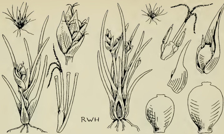
2. Bulbostylis glaberrina Kük. Left, with no basal flowers. Whole plant X^{2/5} , fragment, fruiting inflorescence, flower. HEDBERG 4543, rocky outcrop on Western slope of Mt. Elgon, Uganda. Right, with basal flower. Fragment with aerial and basal inflorescences, whole plant X^{2/5} , aerial flower, aerial bract, basal bract and fruit, aerial and basal fruits. HAMILTON 233, Mt. Elgon crater, Kenya.