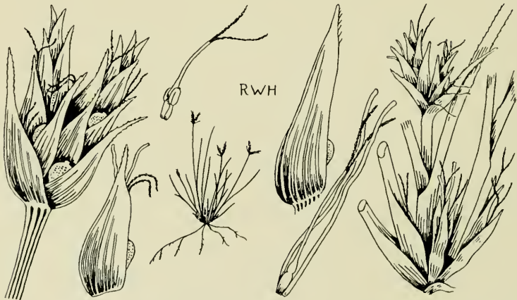
Fig. 1. Bulbostylis humilis KUNTH. From left to right and above downwards: Aerial inflorescence, aerial glume and fruit, aerial flower, whole plant X \frac{2}{5} , basal glume and fruit, basal flower, plant fragment with aerial and basal flowers. NEWBOULD 5855, Malenda Crater Highlands, Tanzania.

In Bulbostylis glaberrima KÜK. (Fig. 2) there may be no basal fruits, as in HEDBERG's No. 4545 from Mt. Elgon. But HAMILTON 233, forming a short turf on a rock surface of the same mountain and at about the same altitude,