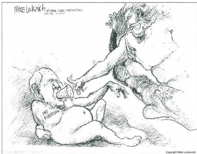
Fig. 1: Mike LUCKOVICH, Atlanta Journal-Constitution, January 15, 2010