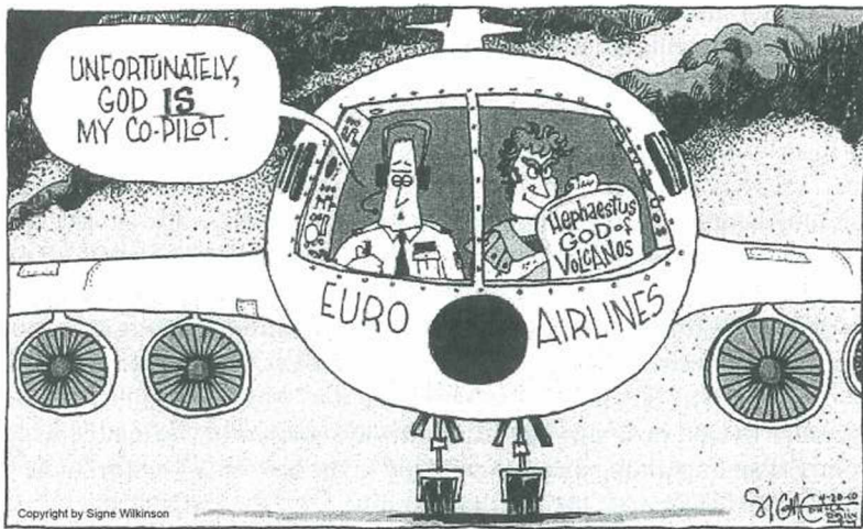
Fig. 3: Signe WILKINSON, Philadelphia Daily News, April 20, 2010