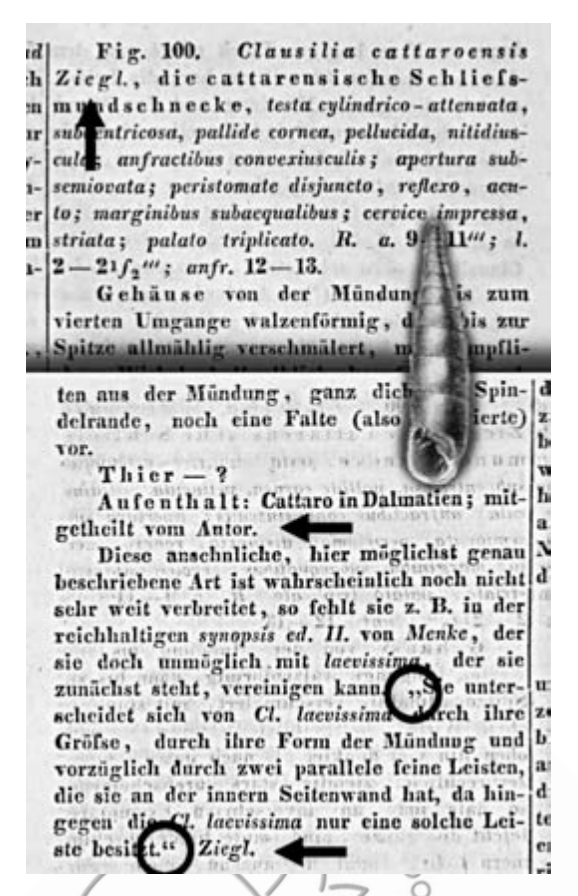
Fig. 6: Original description of Clausilia cattaroensis from Montenegro (currently Montenegrina cattaroensis ) in ROSSMÄSSLER's Iconographie [true date 1835] (the shell was pasted in by myself from plate 7), a very rare example of a descriptive text provided by a shell dealer. ROSSMÄSSLER wrote the Latin diagnosis and a relatively long German description (only partly shown in the figure), and attributed the name in the headline to ZIEGLER (upper black arrow), the author of the manuscript name. ROSSMÄSSLER confirmed that he regarded the shell dealer as the author of the name (middle arrow). At the end of the chapter ROSSMÄSSLER cited in quotes (black circles) a short text attributed to ZIEGLER (lower arrow). Both were co-authors of the original description and of the new name under Art. 50.1.1: Clausilia cattaroensis ROSSMÄSSLER & ZIEGLER, 1835.