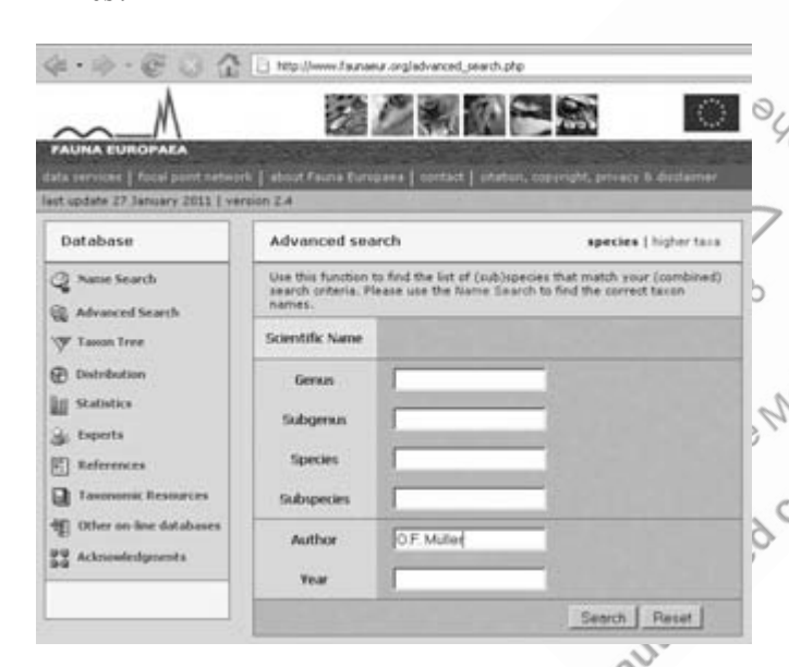
Fig. 8: Fauna Europaea web portal at www.faunaeur.org, a typical online database with mixed standards in terms of authors. Some contributors from 2004 have used initials, others not, and those who used initials did not do it consistently. If you search for O.F. MÜLLER without space you will neither find O. F. MÜLLER with space, nor O. MÜLLER nor MÜLLER (the 2011 version replaced ü by u and ä by a etc., possibly a temporary bug and unusual for a modern database which should work with UTF-8 character encoding).

Having two more components for a unique identifier is another possible interpretation why author and year can be added to genus and species. I would not say either that this is the superior interpretation, or the only one worth to be acknowledged. But it is clear that if large quantities of names are aggregated in electronic data resources, genus and species alone would not suffice. Author and year are needed in biodiversity informatics, in various situations. An aggregated electronic resource containing Helix aspersa and Cantareus aspersus without authors and years can hardly see that the same animals might be meant. Adding "MÜLLER 1774" to both will make it easier.