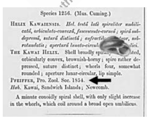
Fig. 5: Original description of Helix kawaiiensis from Hawaii (currently Hawaiia minuscula (BINNEY, 1840)) in REEVE's "Conchologia Iconica" [true date 1854] (the shell was pasted in by myself from plate 182), a typical example of a probably unintended stolen authorship by REEVE. PFEIFFER's name was quoted, but only in an incomplete bibliographical reference to the Proceedings (black arrow), incomplete because the Proceedings had not appeared yet. PFEIFFER's name was not quoted for the description which we have to assume was written perhaps at least partly by REEVE, based on information provided by PFEIFFER in the Zoological Society's meeting. Under SABROSKY's 1974 interpretation of the Code authorship for this species must strictly be attributed to REEVE alone: Helix kawaiiensis REEVE, 1854.

REEVE (1854 [1852]: Pl. 133, No. 818) established Helix caputspinulae, with a description and a figure (Fig. 5). REEVE gave a reference "Helix epsilon PFEIFFER, Pro. Zool. Soc. 1851". This reference was incorrect, it was not published in 1851. The description by PFEIFFER was published in 1853 (vol. 20 p. 57), and differed from the one given by REEVE. Author under Art. 50.1.1 must be REEVE alone.