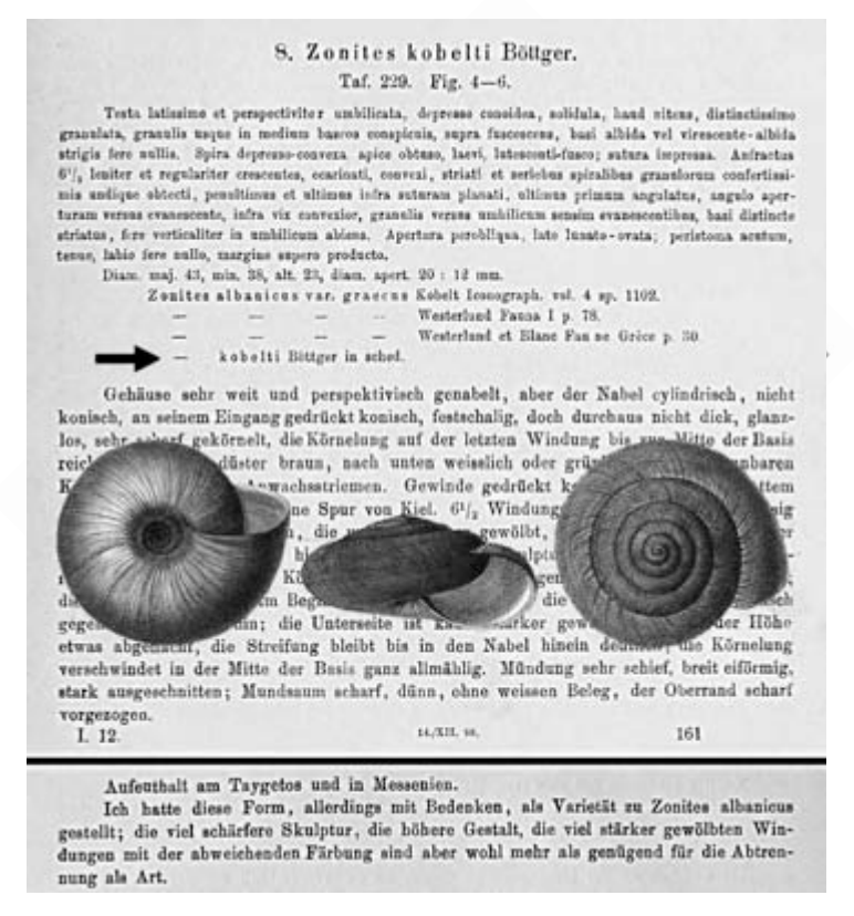
Fig. 4: Original description of Zonites kobelti from Greece (original and current combination) by KOBELT (1905: pp. 869-870 [true date 1898]) (the shells were pasted in by myself from plate 229). The name was attributed to BÖTTGER in the headline of the description. In the 4<sup>th</sup> line of the synonymy (black arrow) was written "- kobelti Böttger in sched.". This confirmed that BÖTTGER had provided the name for the species. The text of the description was not attributed to BÖTTGER, so under Art. 50.1 KOBELT as the author of the work was alone responsible for the description, and for making the name available: Zonites kobelti KOBELT, 1898. When attributing the name to KOBELT we consequently ignore that W. KOBELT never intended to name the species after himself.

Zonites kobelti KOBELT, 1898, currently Zonites kobelti KOBELT, 1898, originally attributed to BÖTTGER who had not made the name available, description was by KOBELT (Fig. 4).