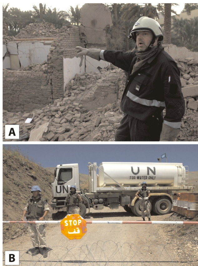
Figure 3: Examples of civil and military geology application for international humanitarian missions: A: AFDRU at Bam, Iran after the December 2003 earthquake, B: Supply of UN post in Syria with fresh drinking water from wells.

After termination of the East-West-confrontation, and the enlargement of both the European Union and NATO, the security-political framework requirements for Austria changed fundamentally. In 2001 the geologist Friedrich Teichmann published an article on the change of traditional “Wehrgeologie” towards civil-military cooperation (CIMIC) focusing on the transition from Cold War to peace support missions (Teichmann, 2011). As military policies have changed during the last decades, so has the use of military geosciences. During the Cold War in Europe, military geography and military geology in the German Armed Forces as well as in the Austrian Armed Forces provided support for tactical decisions of the