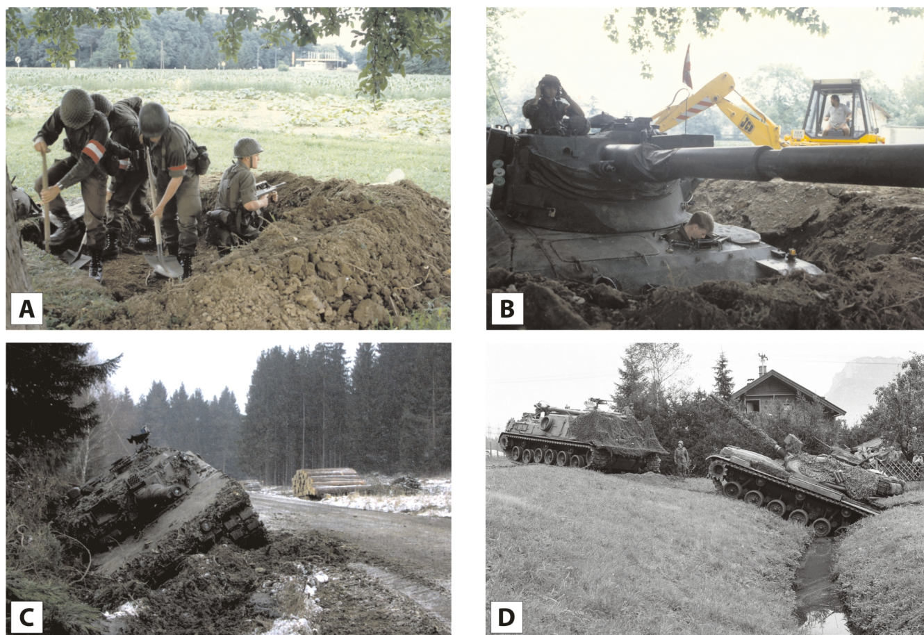
Figure 1: Military geology aspects for security operations at the Austrian border with the former Yugoslavia in 1991 to prevent internal conflict spilling over onto Austrian territory (A, B) and during field exercises (C, D). A: Digging of infantry positions in soft rock using shovel and spade. B: Mechanical assistance for excavation of tank position. C: Battle tank Leopard 2A4 and (D) battle tank Kürsassier bogged down in unsuitable terrain (Photos courtesy of Austrian Armed Forces Press Department).

Classic tasks of military geologists for tactical use comprise assessment of subsoil conditions down to a depth of 3 metres to guide construction of defence positions and the enhancement of local natural obstacles for reducing the speed of tank attacks (Fig. 1). Modern textbooks on military geology are lacking and therefore the older textbooks still are in use in German-speaking countries. For the international geoscientific community, textbooks on military geography partly also