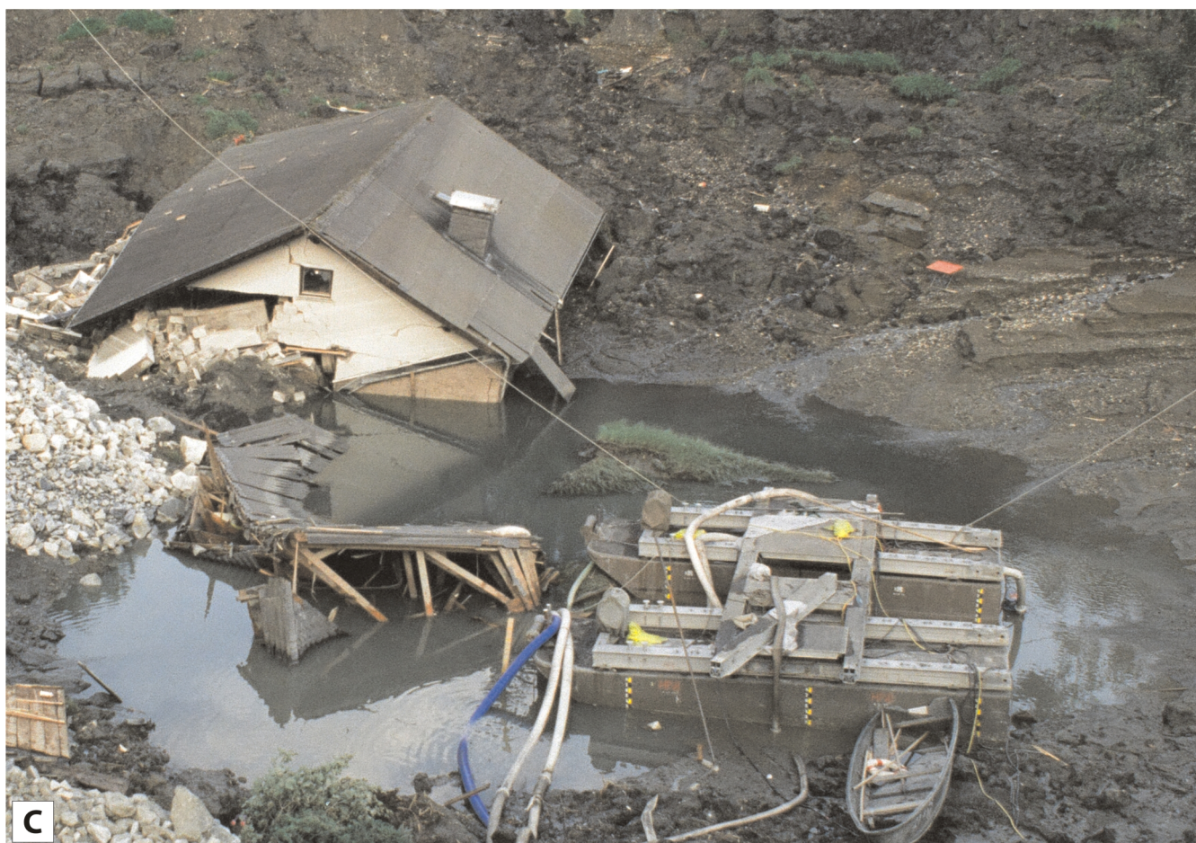
Figure 2: Civil and military geology application in case of assistance operations for natural- and man-made disasters A: Dam re-enforcement by filling sand bags for protection of Krems during flood in 2002. B: Engineer tank clearing river blockage after heavy rainfall in 2005. C: Emergency evacuation from sink hole in talcum mining area of Lassing, Styria, in July 1998 (All photos courtesy of Austrian Armed Forces Press Department).